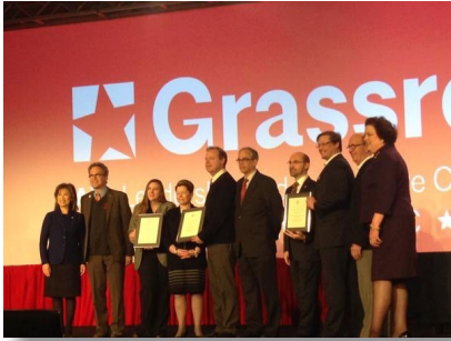
↑ AIA National Award for AIA Regional Recovery Working Group