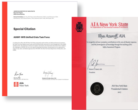
↑ Awards: City, State, and National