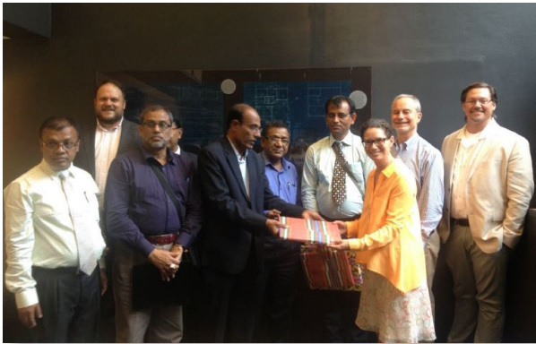
↑ Meeting Bangladesh delegation with AIA New York