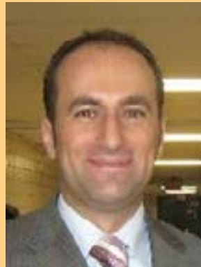
Ekland Skifteri InterContiental Times Square