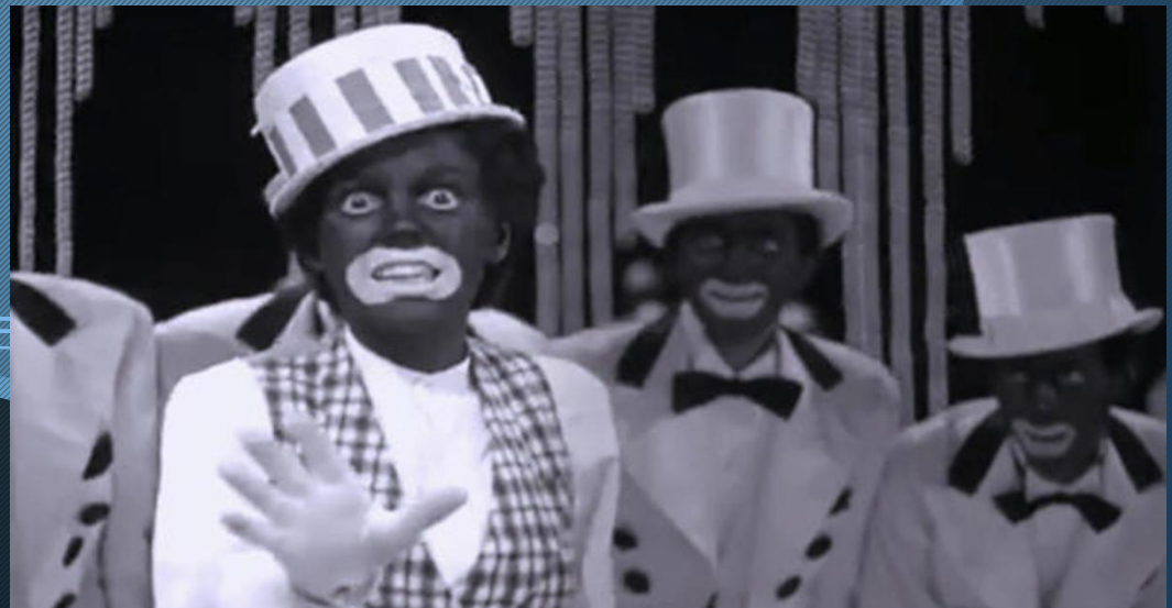
Figure 1: Blackface (CBS News, 2018)