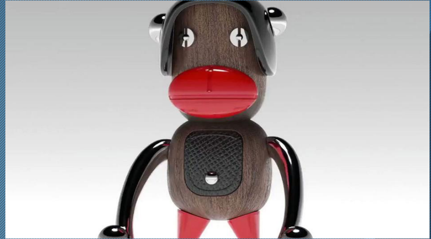
Figure 6: $550 Prada Group keychain(HypeBeast, 2018)