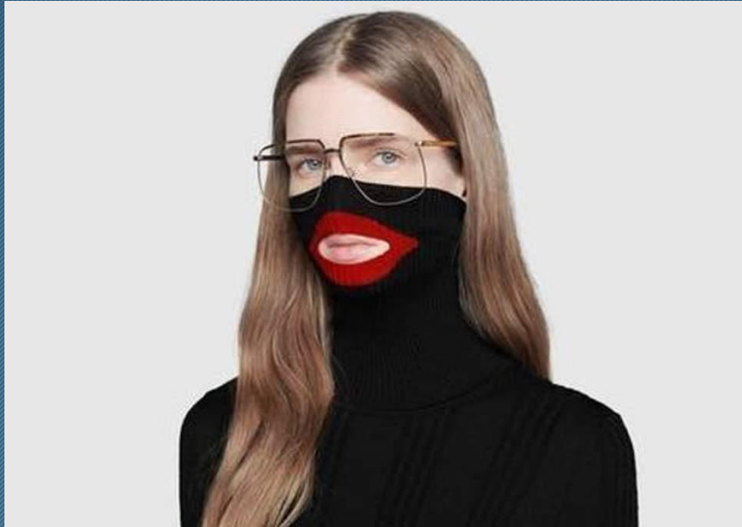
Figure 4: Gucci Sweater (The Independent, 2019)