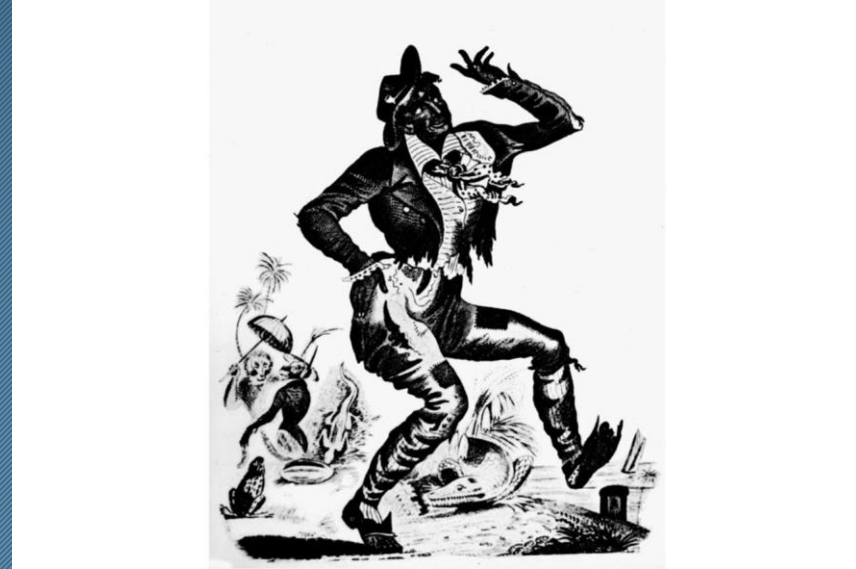
Figure 2: Jim Crow Character

In 1828, Thomas Dartmouth Rice debuted in blackface as the infamous “ Jim Crow ” which became a hallmark of racial tension in the South and birthed an American stereotype which to this day pervades and can be falsely associated with African Americans internationally.