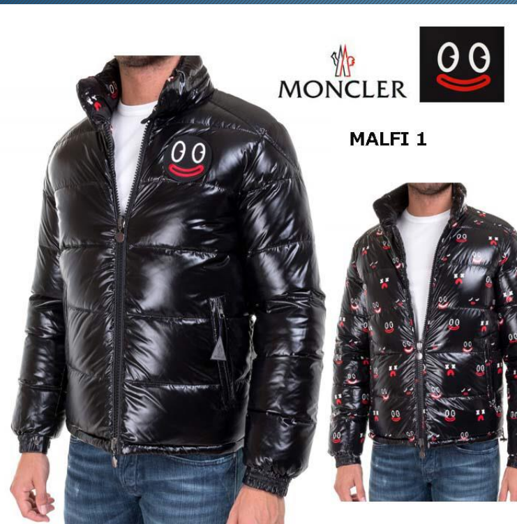
Figure 7: Moncler "Malfi 1" Collection 2016 (Essemce, 2016)