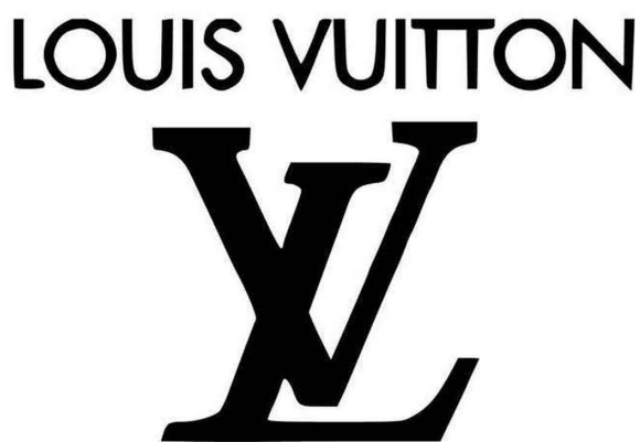
Louis Vuitton Official logo.

It is the 21st century and it is everyone's dream to own a Louis Vuitton item. Louis Vuitton has taken fashion by storm. It is one of the top fashion brands and has stores worldwide. The brand focuses on luxurious items. As of May 2017, Forbes estimated the brand value of Louis Vuitton to be around $28.8 Billion. With massive customers worldwide, Louis Vuitton can design any item and people would pay a ton of money to get it. The founder Louis was born to a family that made a meager wage as farmers. By 1854, he was