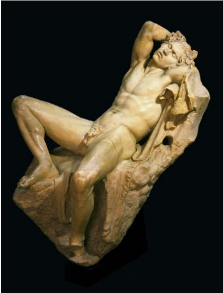
Sleeping satyr (Barberini Faun), c.230-200