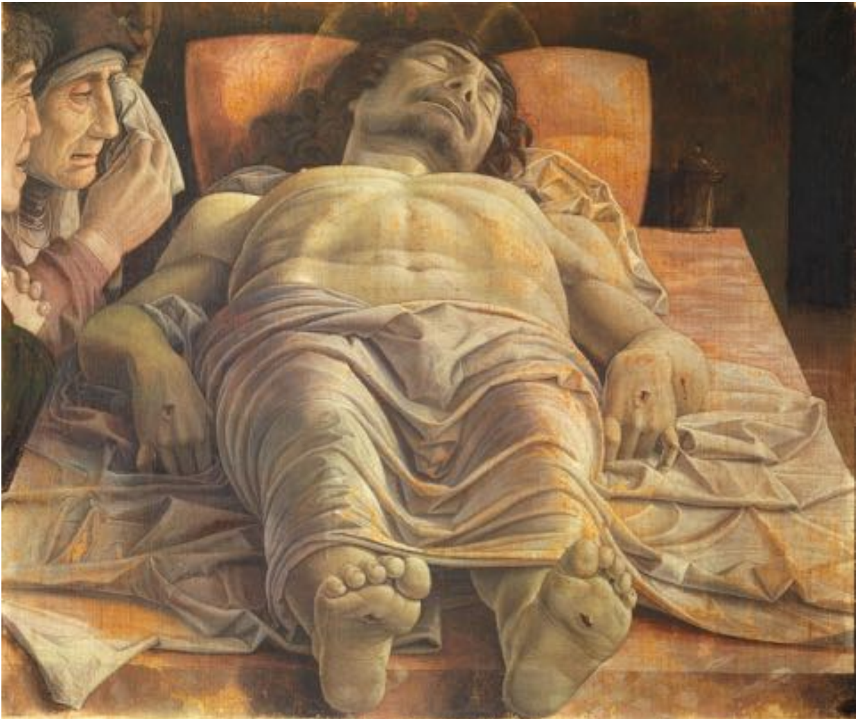
Andrea Mantegna, Foreshortened Christ , c.1500