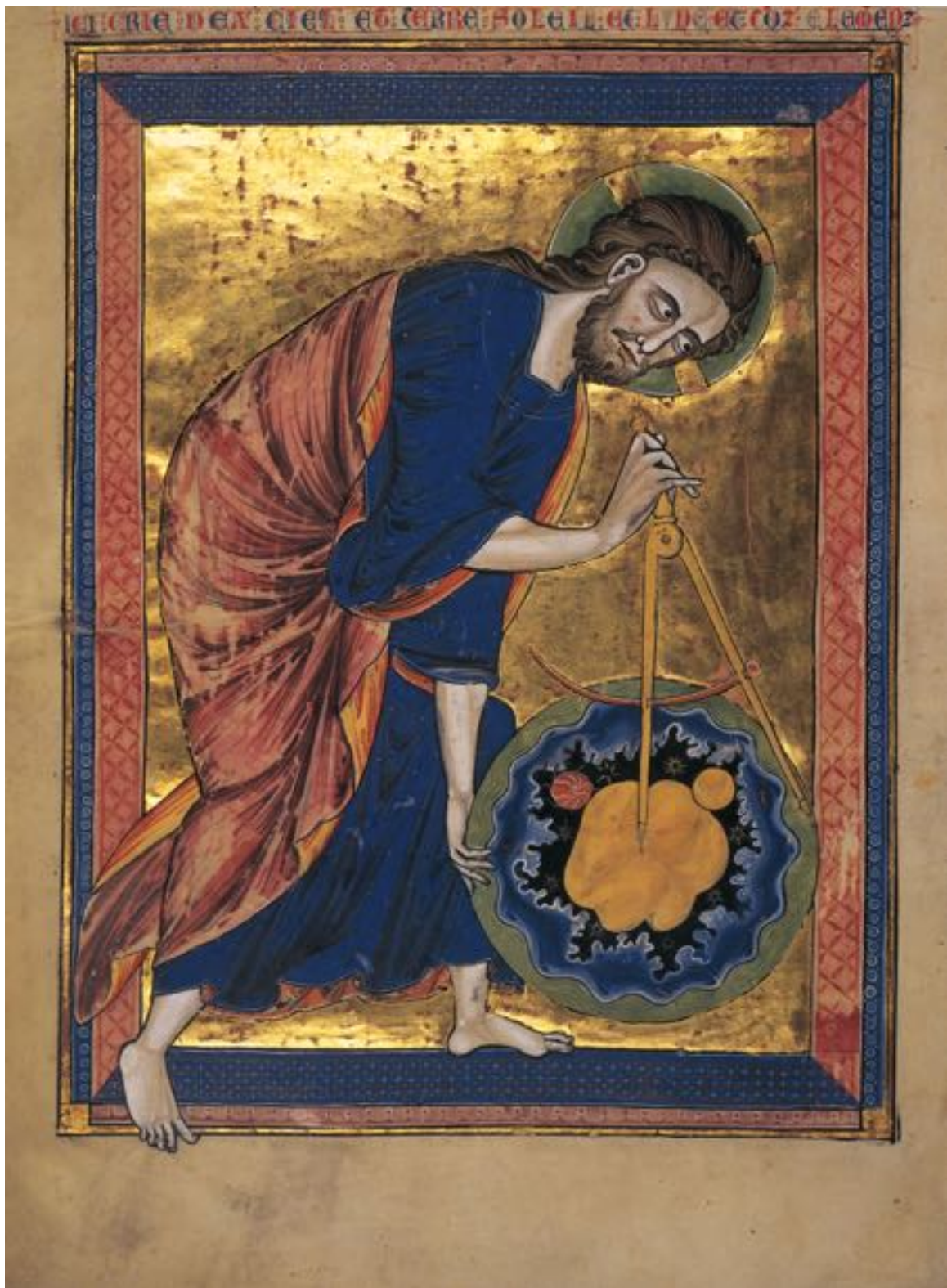
God as architect of the world, c.1220-1230