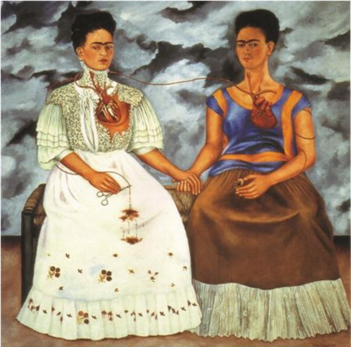
Frida Kahlo, The Two Fridas , 1939