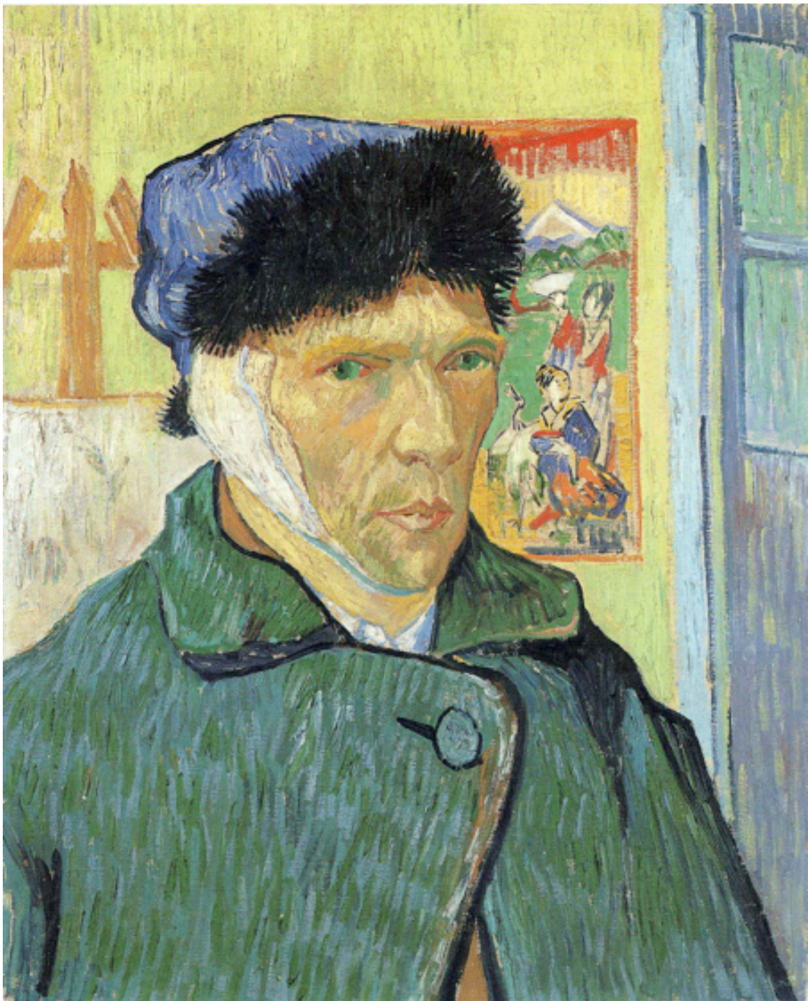
Vincent Van Gogh, Self-portrait with bandaged ear , c.1889