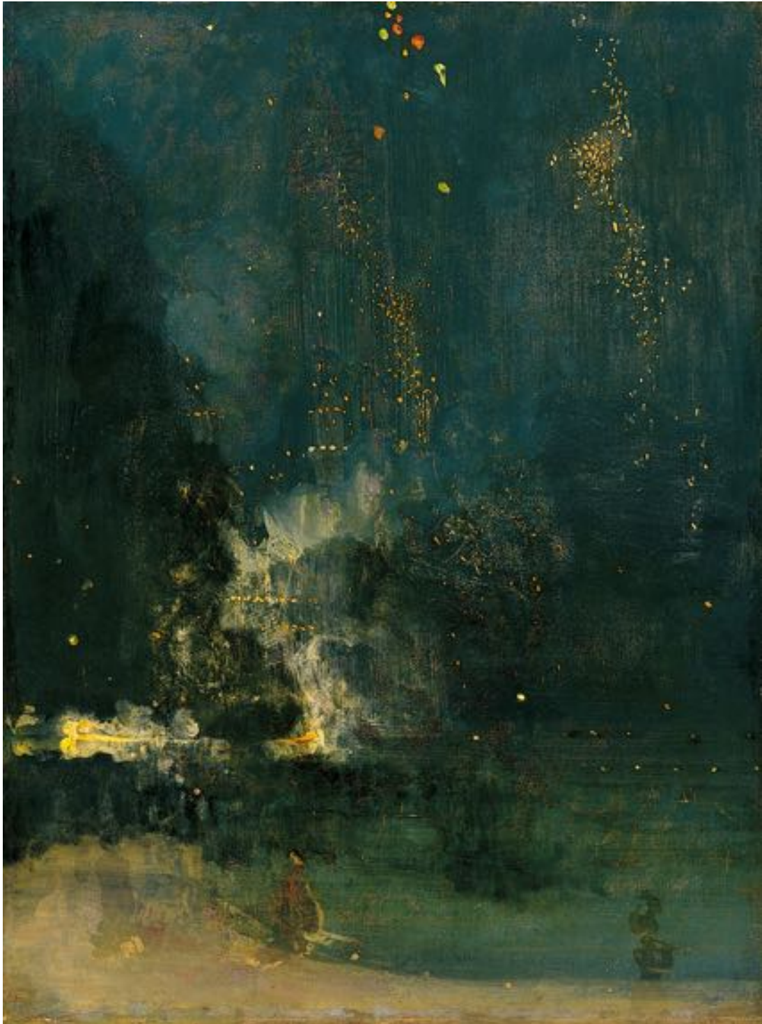
13.6 James Abbott McNeill Whistler, Nocturne in Black and Gold (The Falling Rocket) , c. 1875