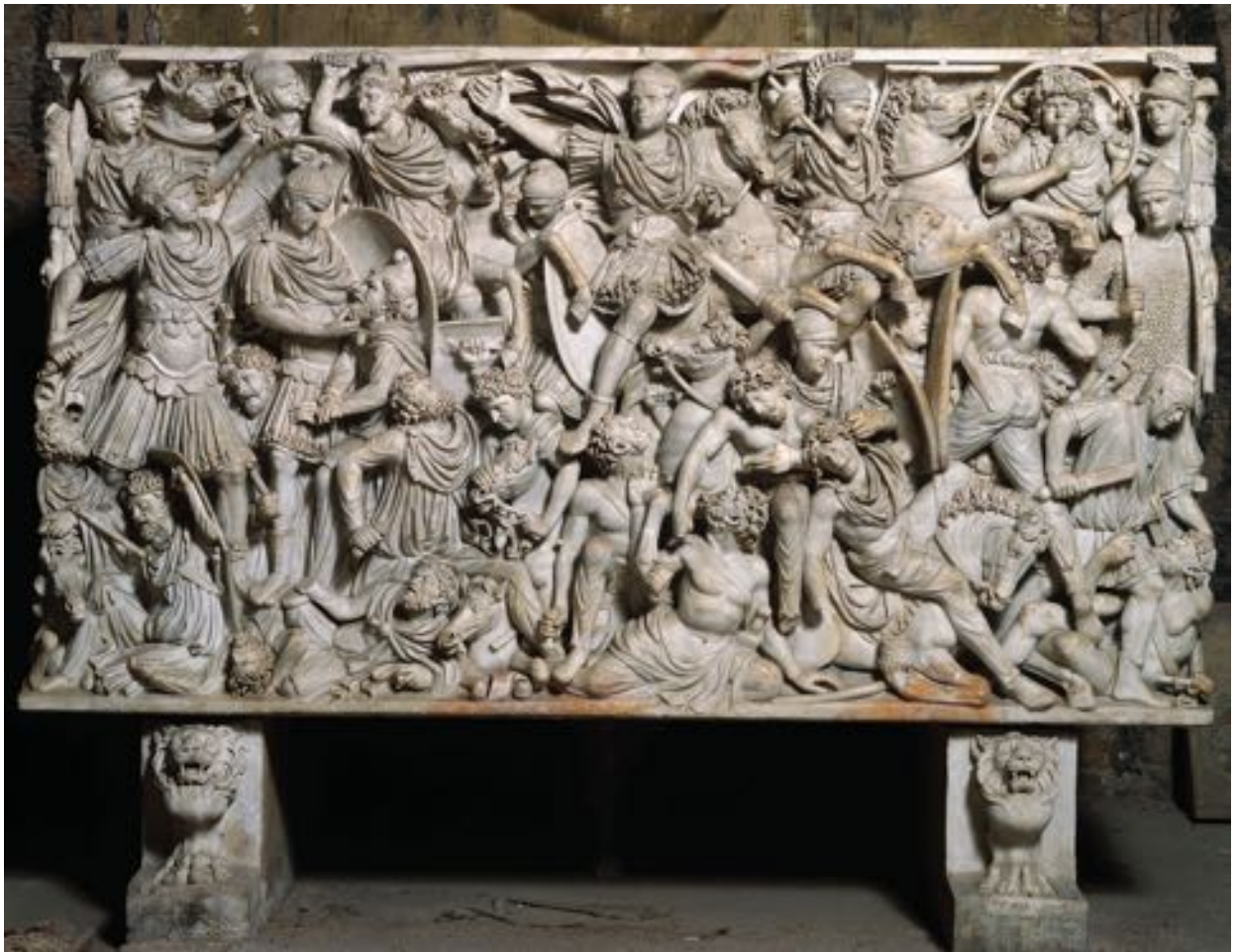
Sarcophagus with battle of Romans and barbarians, (Ludovisi Battle Sarcophagus), c.250-260