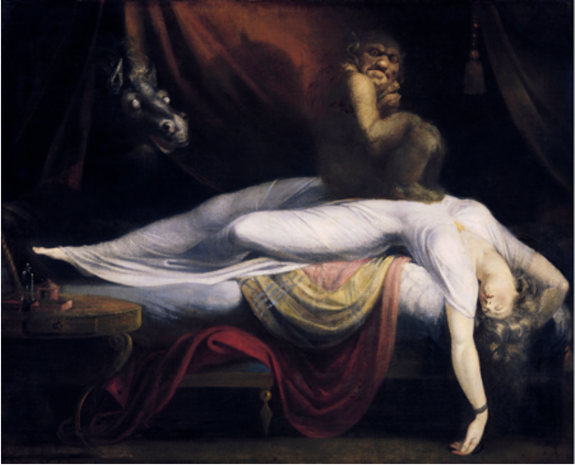
Henry Fuseli, The Nightmare , 1781