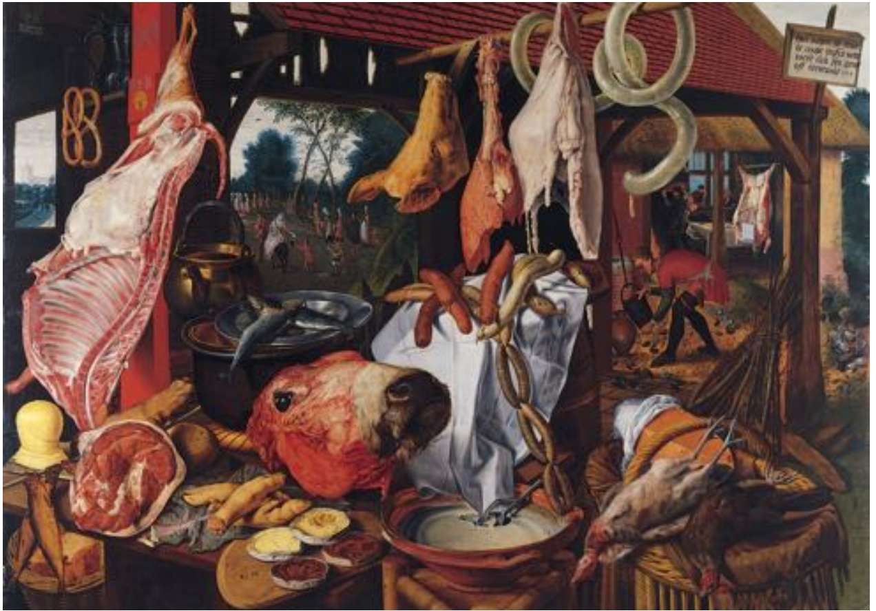
Pieter Aertsen, Butcher's Stall , c.1551