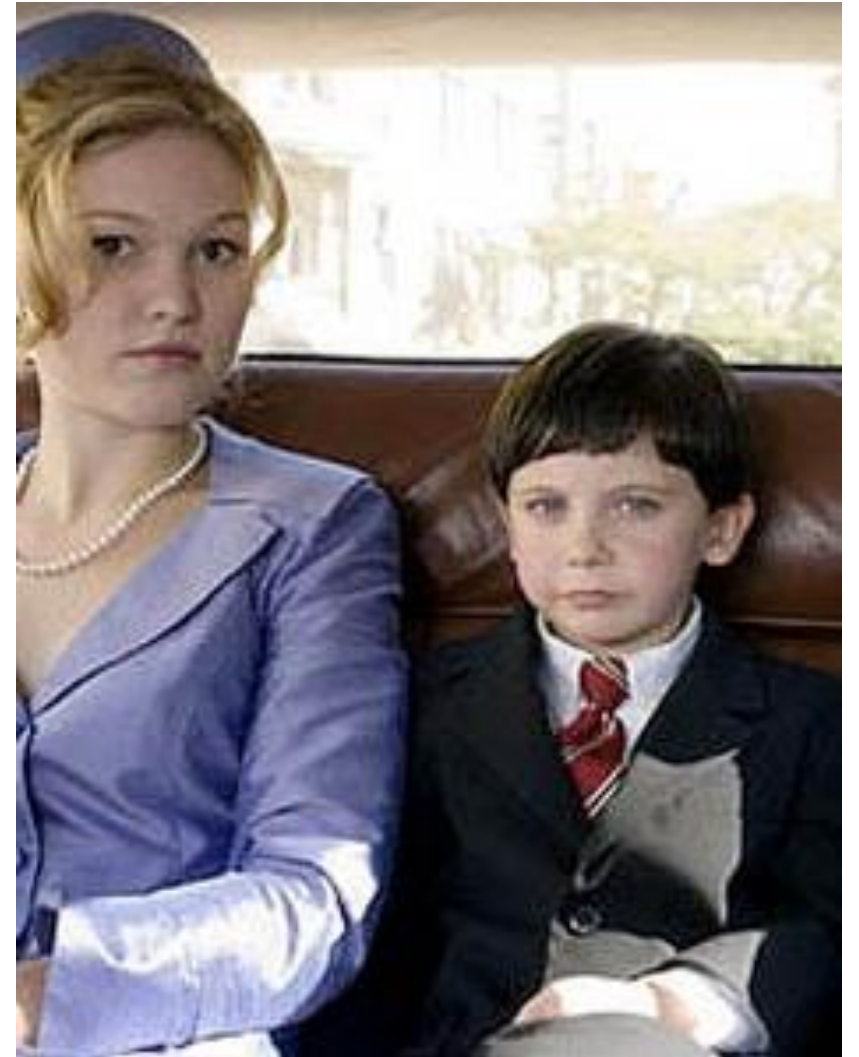
Figure 2. The Omen (2006). In this scene Damian and his parents are being driven to church, wearing a classic suit designed by George L. Little