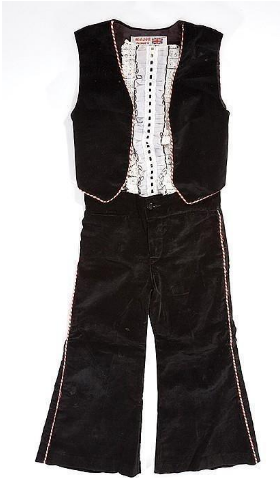
Figure 1. The Omen (1976). The three piece velvet suit Damian wore in the car scene of the film, designed by Tiny Nicholls.

Two piece suit worn in the car scene, designed by George L. Little.