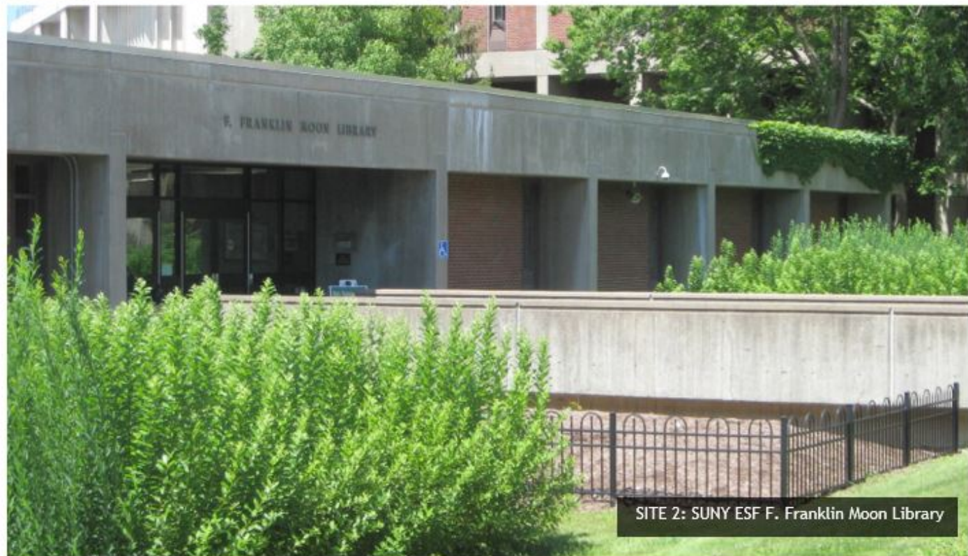
SITE 2: SUNY ESF F. Franklin Moon Library