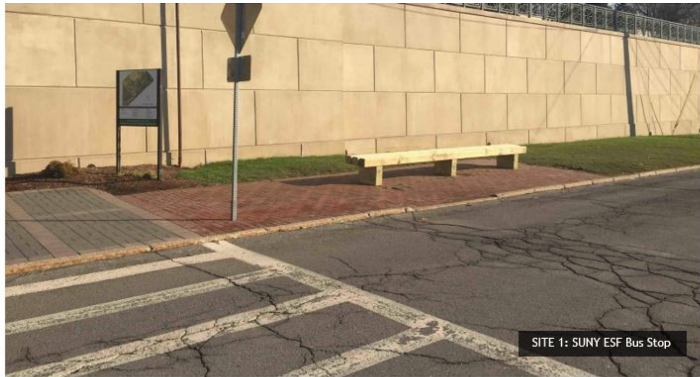
SITE 1: SUNY ESF Bus Stop

Successful design proposals will embrace mass timber design strategies, solving multiple challenges including material sourcing, sustainable fabrication and construction methods, and visual/aesthetic connection of the design to its location. Designs will be economically and socially sustainable, inclusive and equitable, and visually compelling. Individuals or teams may submit Design Proposals for a single site or both sites. If submitting for both sites, two separate proposals must be submitted.