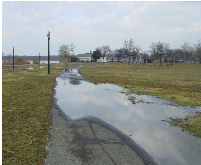
Serious drainage problems