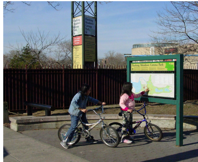
Signage and wayfinding

Before developing a set of recommendations for the Park's future, we assessed the physical condition of the Park. This review of the Park's status is based on a number of different sources.