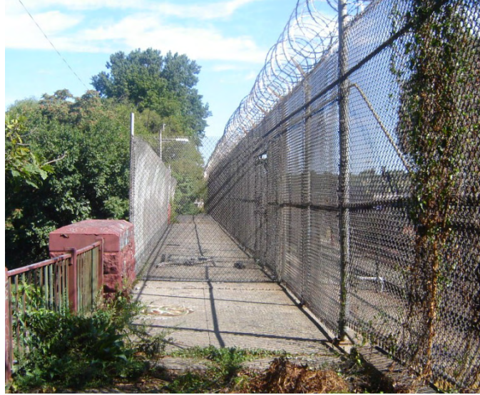
Closed pedestrian bridge