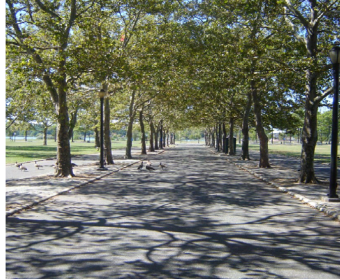
Excessive pedestrian paths