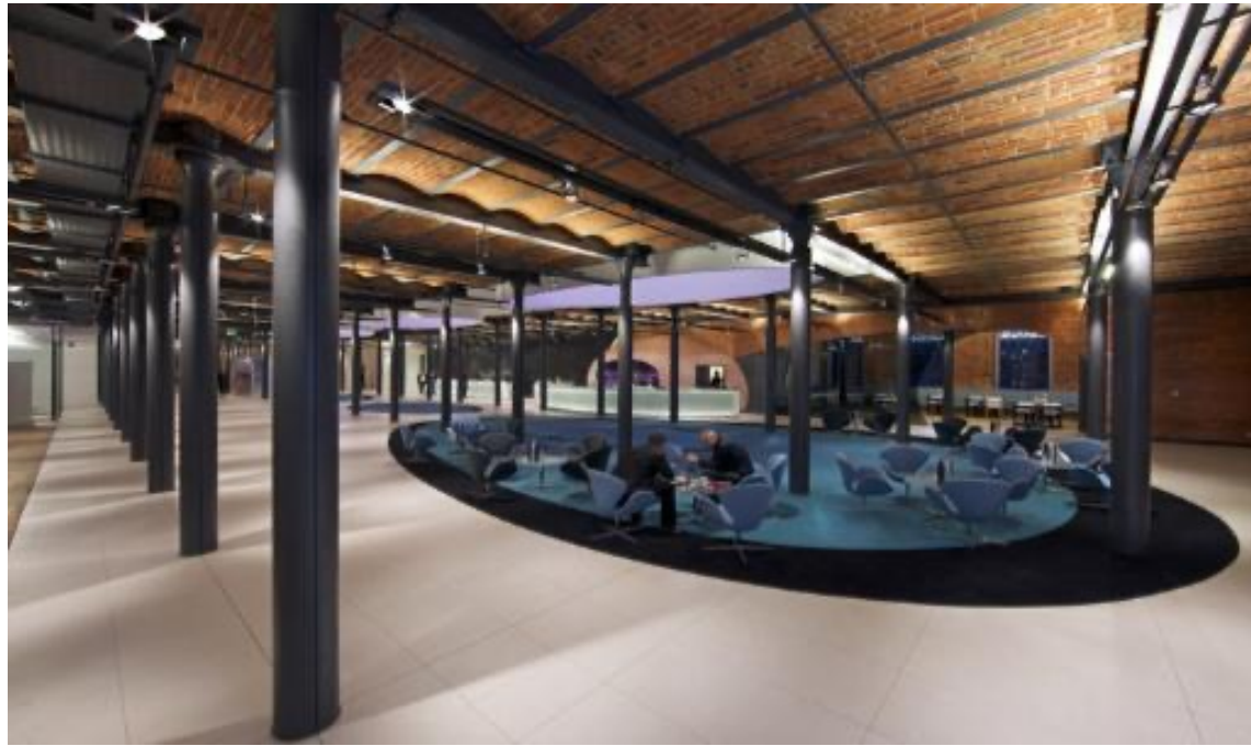
Andels Hotel Lodz, Poland