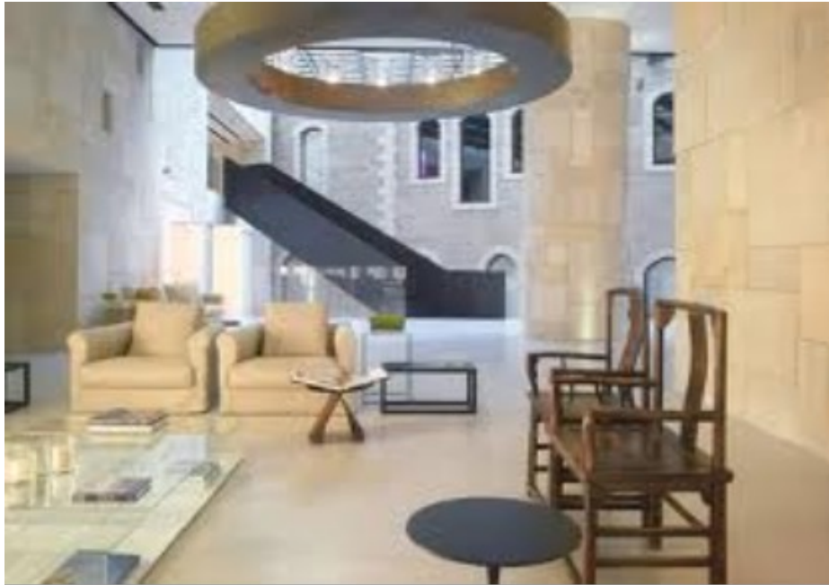
Mamilla Hotel , Jerusalem