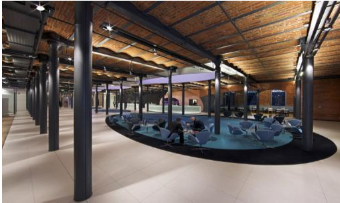
Andels Hotel Lodz, Poland