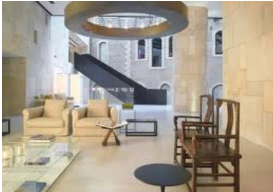
Mamilla Hotel , Jerusalem