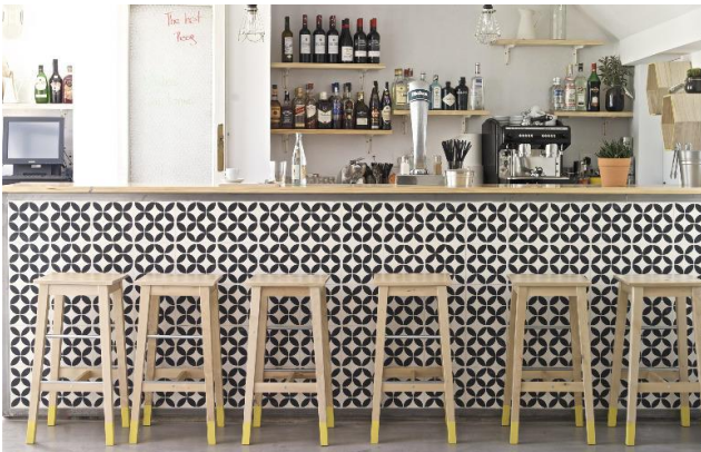
The Hat (Madrid, Spain)