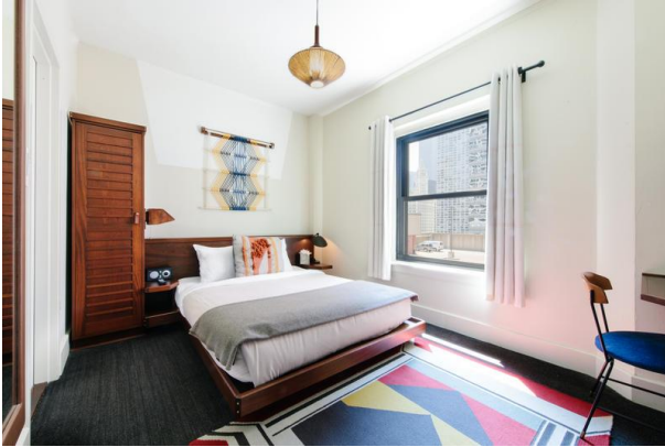
Freehand (Chicago, IL)