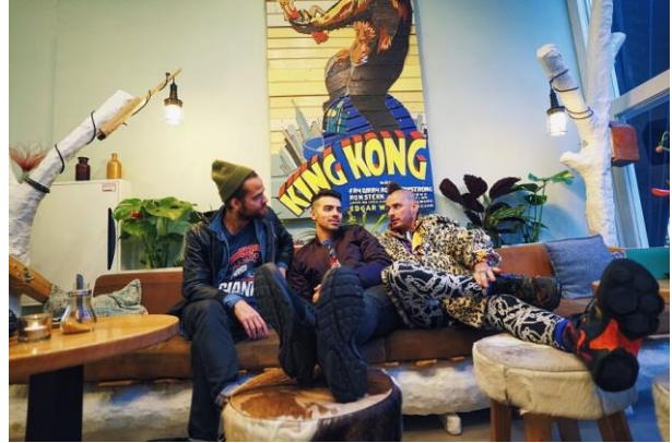
King Kong (Amsterdam, Netherlands)