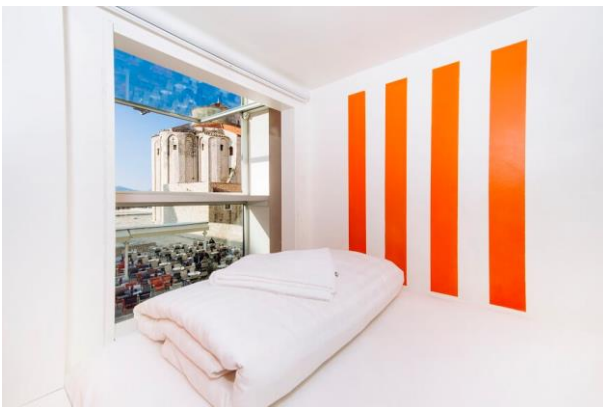
Boutique Hostel Forum (Zadar, Croatia)