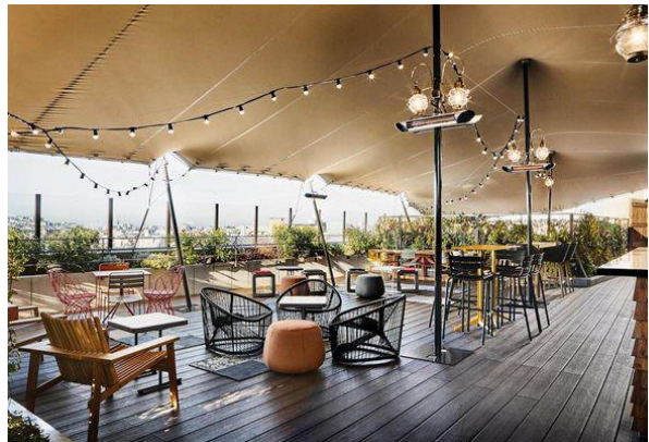
Generator (Paris, France)