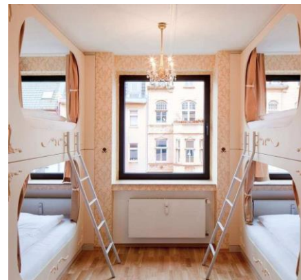
Die Wohngemeinschaft (Koln, Germany)