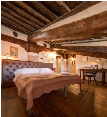
Generator (Venice, Italy)