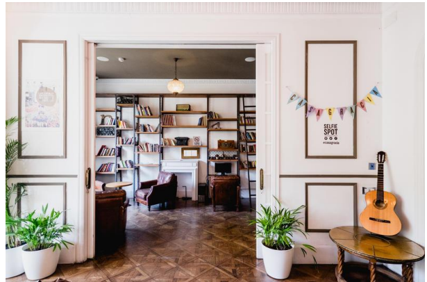
Casa Gracia (Barcelona, Spain)