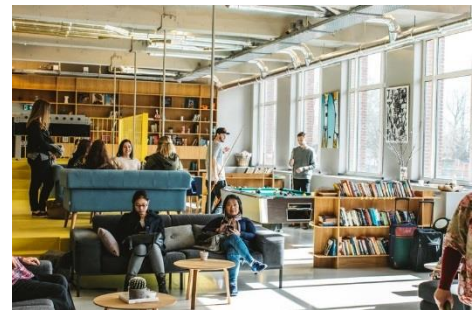
Clink Noord (Amsterdam, Netherlands)

Hostels emphasize shared spaces and address a need for social interaction that is not met elsewhere in hospitality. From the café to the co-working space and the guest kitchen, a hostel is designed to facilitate connection between travelers. The best hostels use events like organized dinners, exercise classes, and city tours to further enhance interaction.