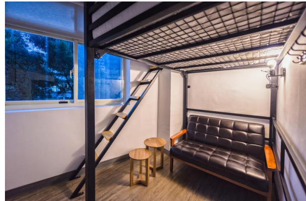
Meander (Taipei, Taiwan)