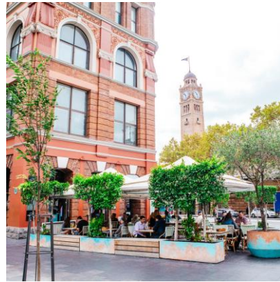
Wake Up (Sydney, Australia)