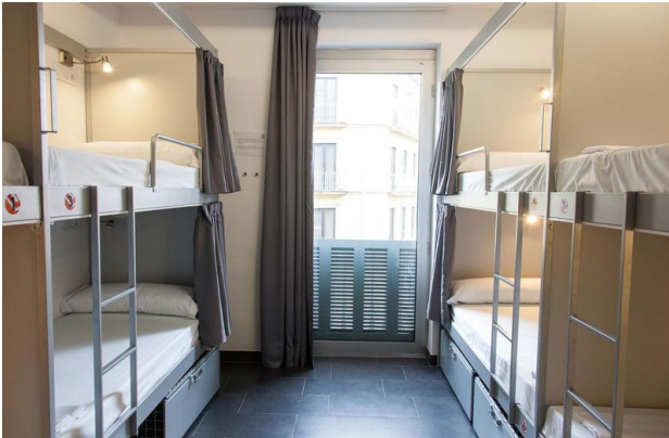
St. Christopher's (Barcelona, Spain)