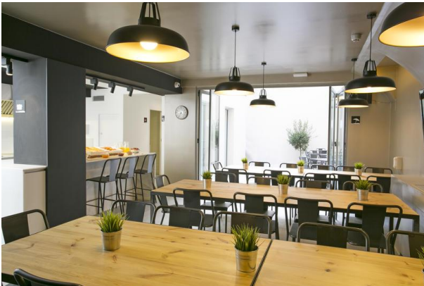
Saint Jordi (Barcelona, Spain)