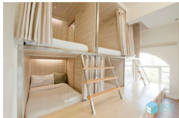
Boxpackers (Bangkok, Thailand)