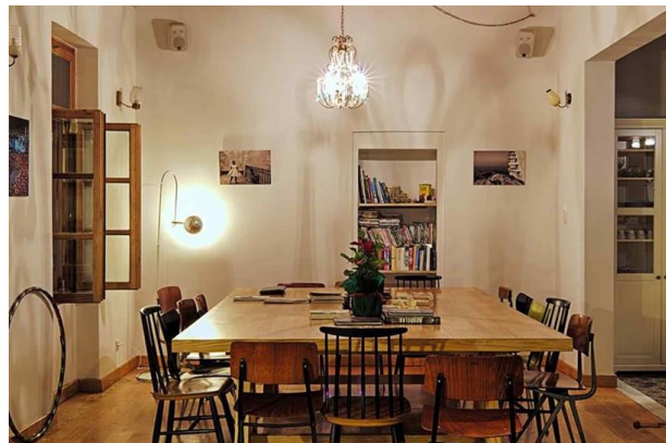
City Circus (Athens, Greece)