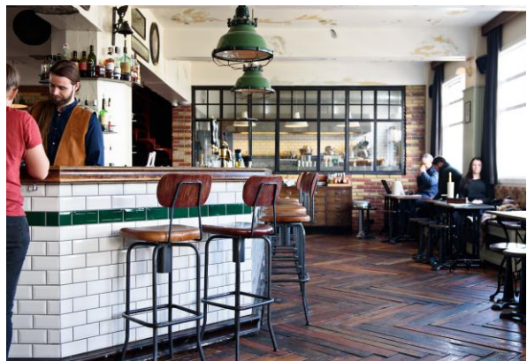
Kex (Reykjavik, Iceland)