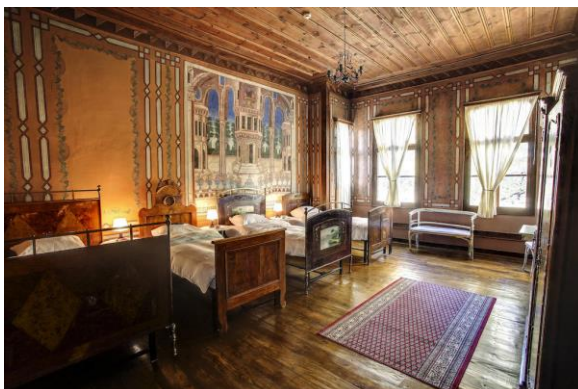
Old Plovdiv House (Plovdiv, Bulgaria)