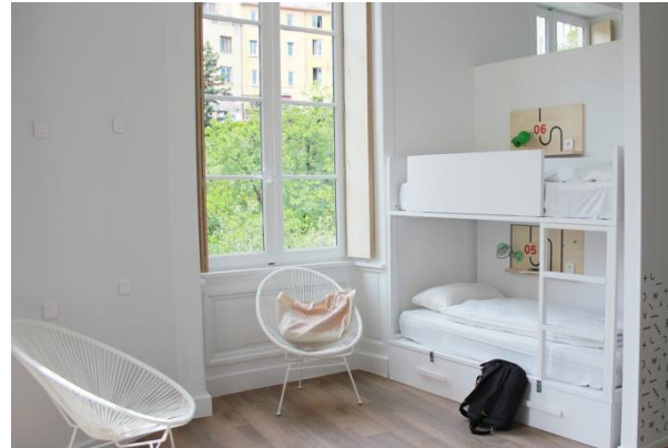
Away (Lyon, France)