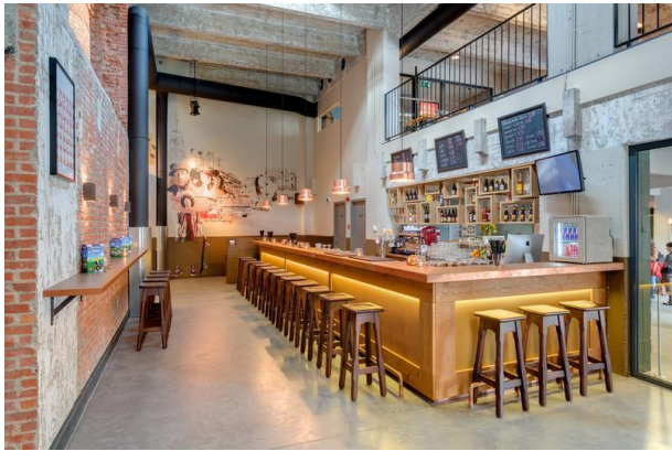
Meininger (Brussels, Belgium)