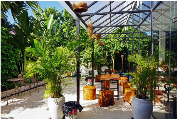
Onederz (Siem Reap, Cambodia)