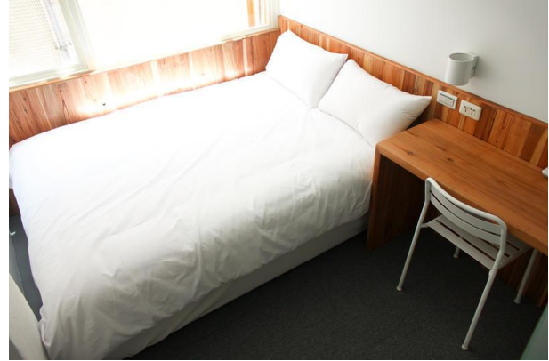
Star (Taipei, Taiwan)