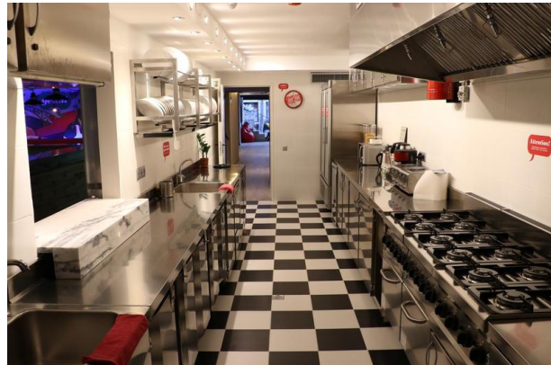
Yeah (Barcelona, Spain)