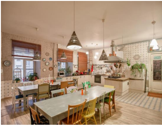
Soul Kitchen (St. Petersburg, Russia)