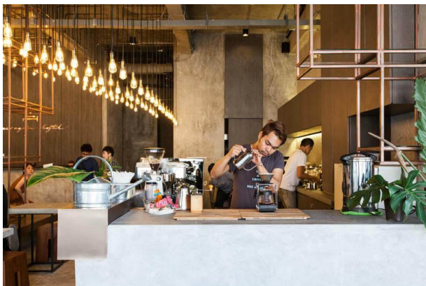
Once Again (Bangkok, Thailand)