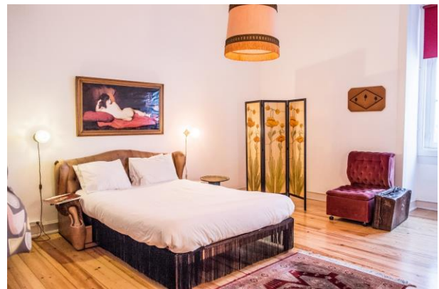
Lisbon Calling (Lisbon, Portugal)