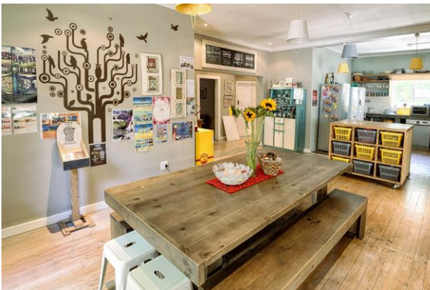
The B.I.G. (Cape Town, South Africa)