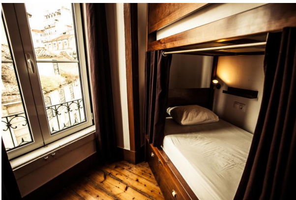
Home (Lisbon, Portugal)