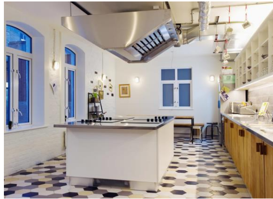
Wombats (London, UK)