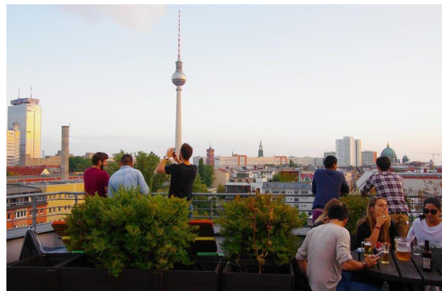
Wombats (Berlin, Germany)

Great hostels use events to showcase the local community and further build foot traffic. These are varied and can include live music, art exhibitions, pop-up markets, a visiting local bartender or restaurateur, or any number of unique local activities.