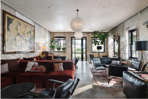
The Native (Austin, TX)