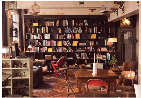
Kex Hostel (Reykjavik, Iceland)

Hostels have changed dramatically over the past decade, particularly in Western Europe. What were once backpacker crash pads with a reputation for filth and theft are now upscale boutiques with James Beard Award-nominated bars and clean, modern dorms.