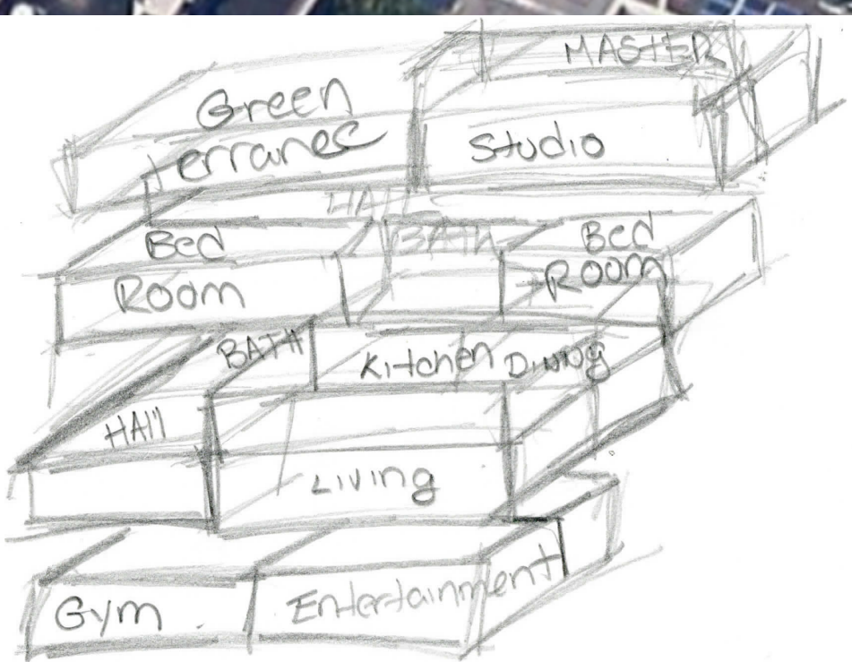
Sketch of rooms