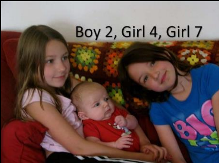
Boy 2, Girl 4, Girl 7

-The father is a fellow architect with specific requirements being a designer as well. He doesn't have guests over as he is always out on the road working on projects. He hopes to have a living room with a lot of light with a large enough wall for a projector as he is an avid movie watcher. He prefers light for when he works at home and does not plan on renting out or having extra rooms for others. He works out regularly so he wants a gym and a pool with an optional hot tub. He prefers navy blue and white as colors, yellow is out of the question and wants a unisex color for the future baby. Generally a private home he sometimes has co-workers for small get-togethers with drinks so a small bar area would be perfect.