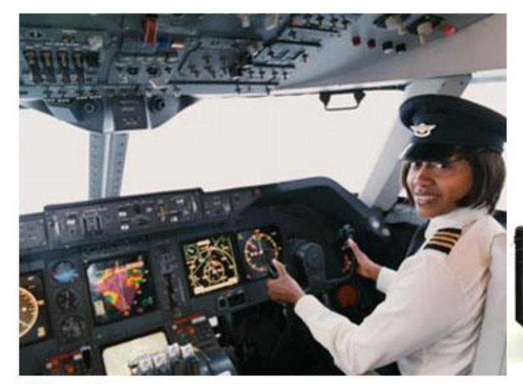
Airline Pilot Gone on average up to 3 nights a week.