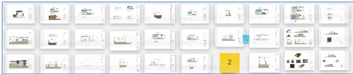
Sample Miro.com Pinup Board

The chosen building must be a multi-story steel building that contains both elevator and stair cores. It is best if the façade contains two different materials and that the building includes a lobby/atrium with a double height space. These two criteria are helpful but not mandatory. Good choices are public buildings (CUNY Buildings, Museums, Libraries) located in New York or the vicinity so they can be visited. You must be able to find enough detailed information about the building so you can model it in Revit. This includes full plans, sections & elevations that show structure and include dimensions. Consider reaching out directly to the architect, look to their websites and look for buildings that are well published.