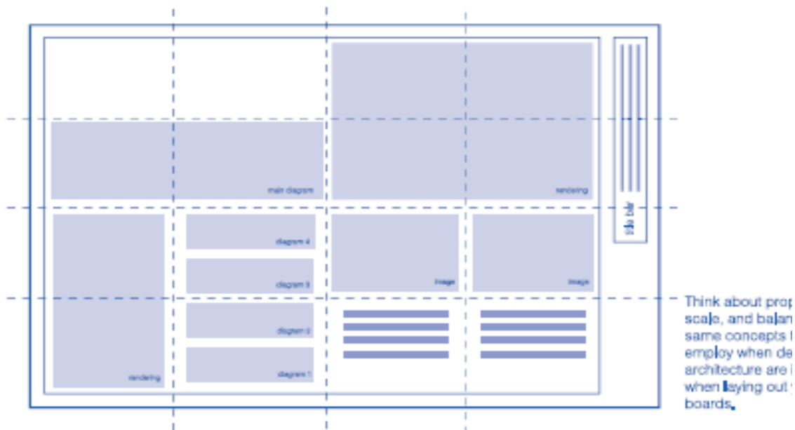
Grid to be employed for interior portfolio pages

You will present your work quickly at the beginning of class