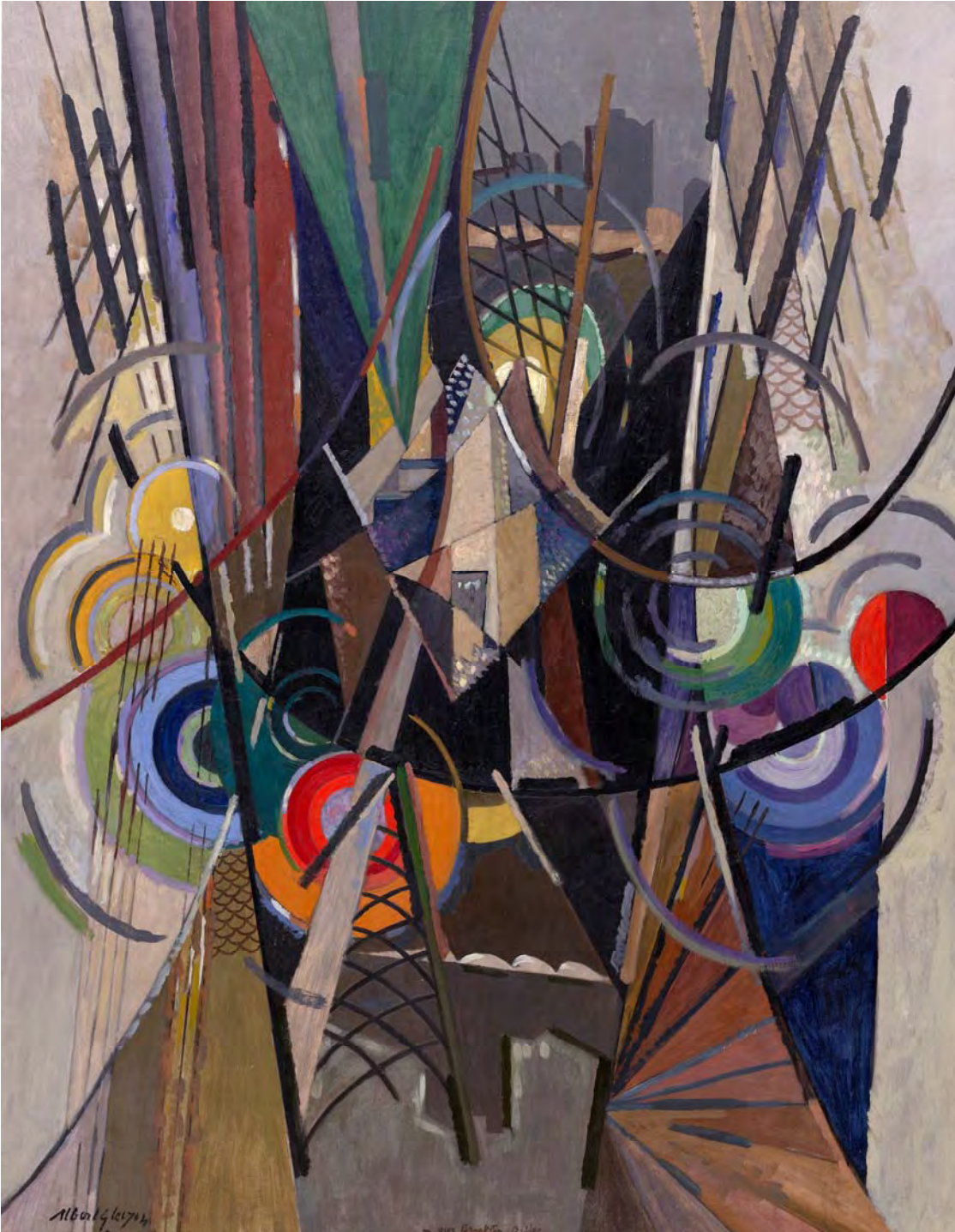
Albert Gleizes (1881-1953), On Brooklyn Bridge , oil on canvas, 63.3/4x51", 1917, Guggenheim Museum.