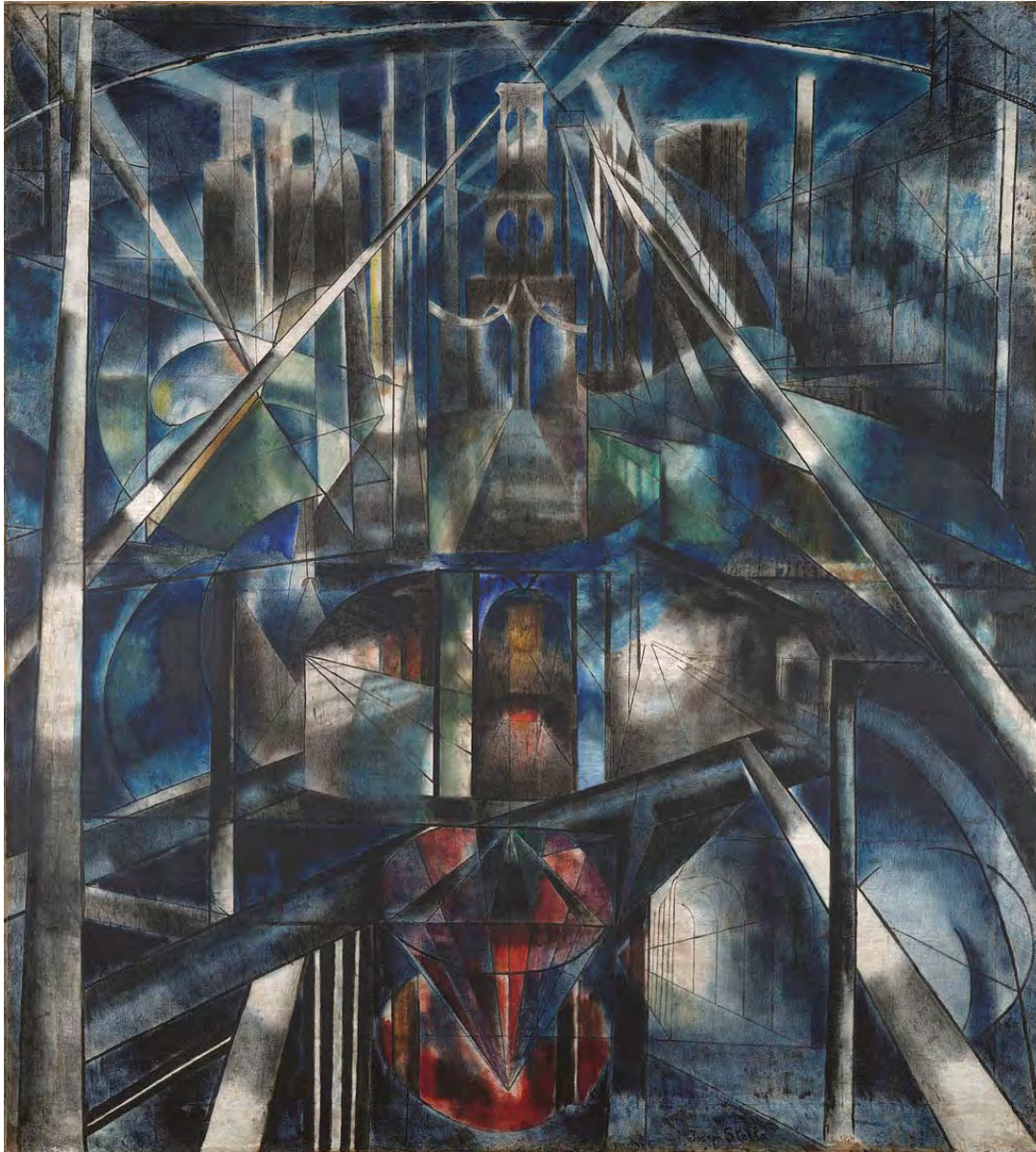
Joseph Stella (1877-1946), Brooklyn Bridge , oil on canvas, 215.3 x 194.6 cm, 1919–20, Yale University Art Gallery. (Futurism)