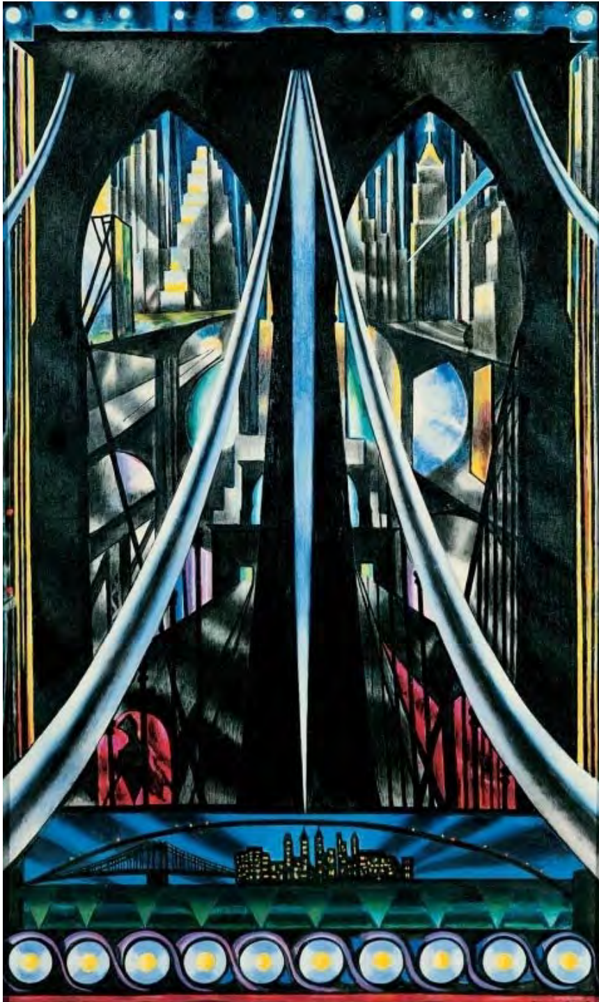
Joseph Stella (1877-1946), The Brooklyn Bridge: Variation on an Old Theme , oil on canvas, 215.3 x 194.6 cm, 1939, Whitney Museum.