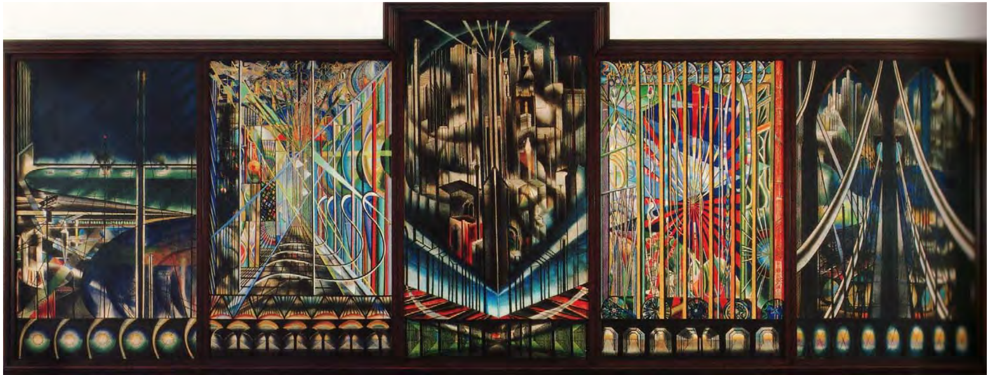
Joseph Stella (1877-1946), Voice of the City of New York Interpreted , oil and tempera on canvas, 99.3/4 x 270", 1920-22, Newark Museum.