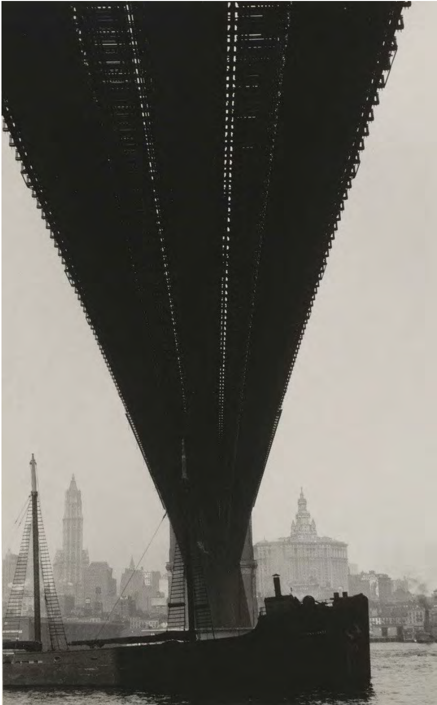
Walker Evans (1903–1975), Brooklyn Bridge, New York , 8.13/16x5.3/8", gelatin silver print, 1929, The Metropolitan Museum of Art.