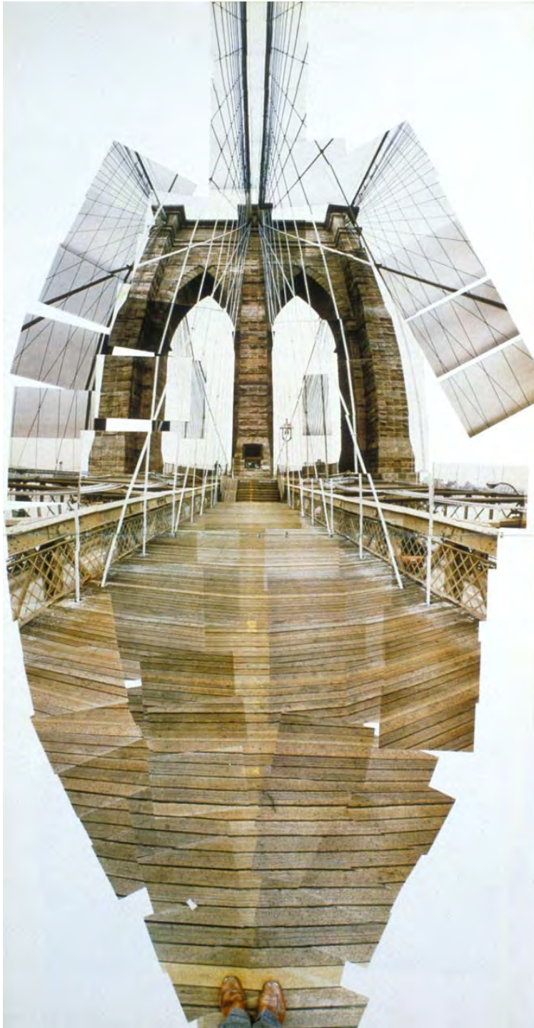
David Hockney (1937-), The Brooklyn Bridge, Nov. 28 th , 1982 , photographic collage, 42.15/16 x 22. 13/16", 1982, private collection.