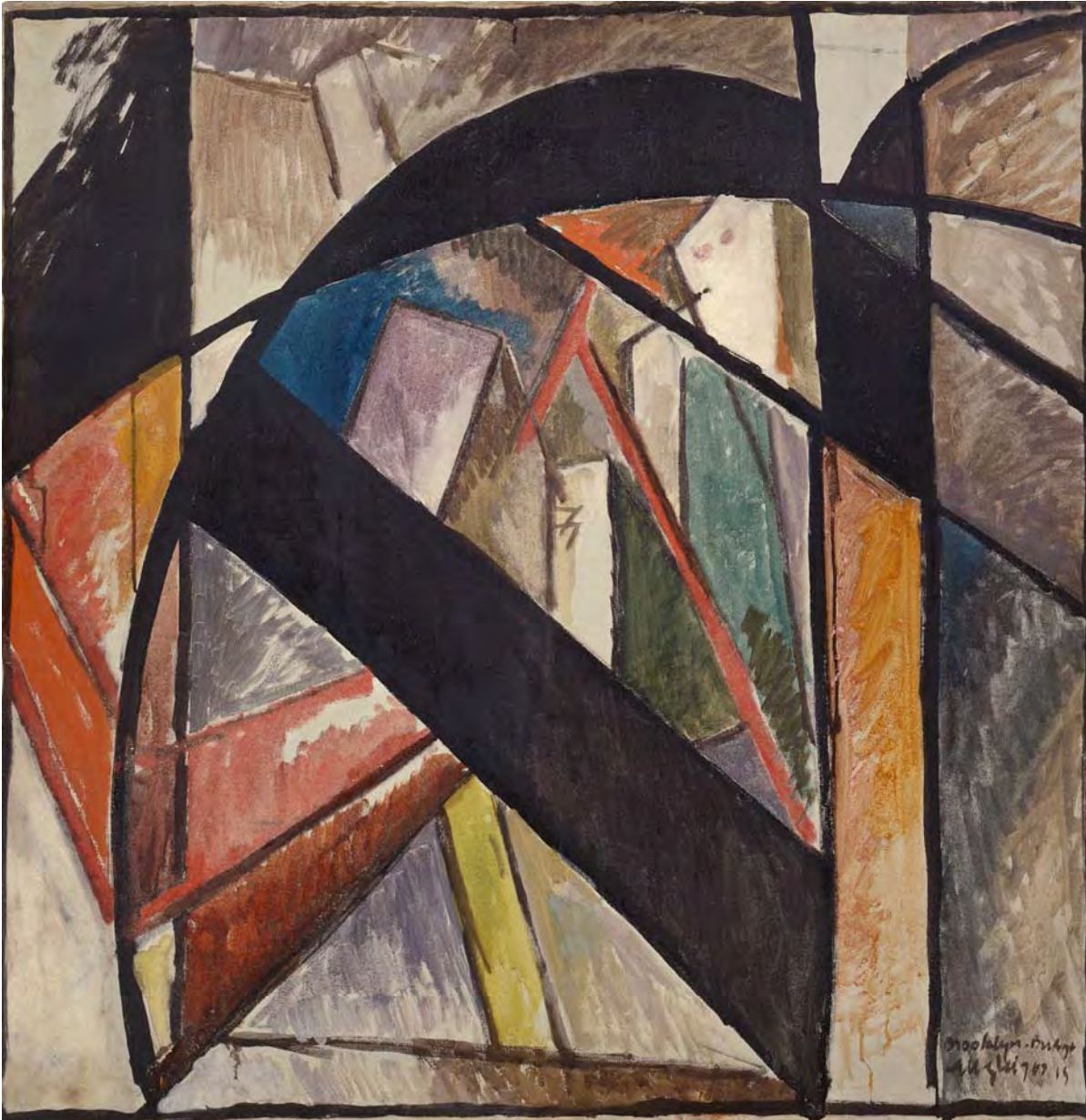
Albert Gleizes (1881-1953), Brooklyn Bridge , oil and gouache on canvas, 40.1/8x40.1/8", 1915, Guggenheim Museum. (Cubism)