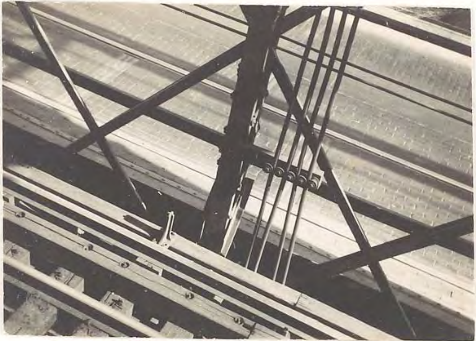
Walker Evans (1903–1975) , Elevated Train Tracks and Street Below, Brooklyn Bridge, New York City , 1.9/16x2.1/4", gelatin silver print, 1928-30, The Metropolitan Museum of Art.