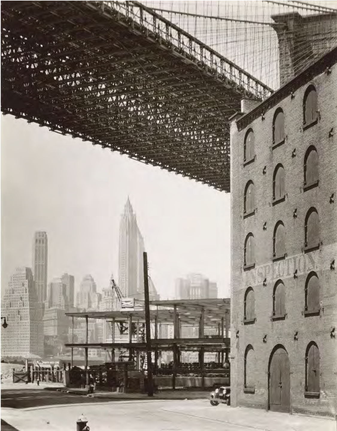
Bernice Abbott (1898-1991), Brooklyn Bridge, Water and Dock Street, Brooklyn , gelatin silver print, 18x14.3/8", 1936, Smithsonian American Art Museum.