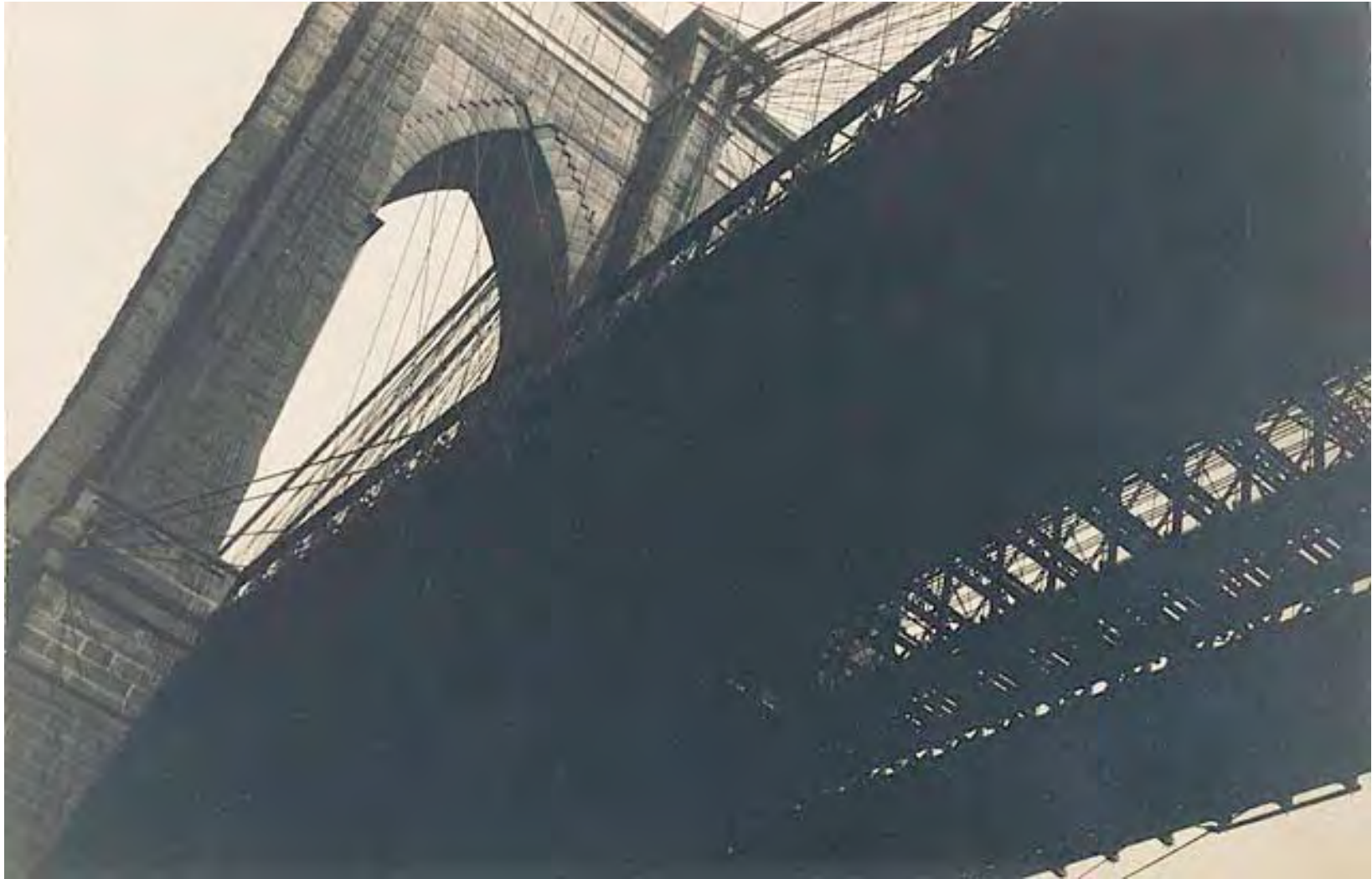
Walker Evans (1903–1975), Brooklyn Bridge, New York , 1.1/2x2.1/2", gelatin silver print, 1929, printed ca. 1970, The Metropolitan Museum of Art.