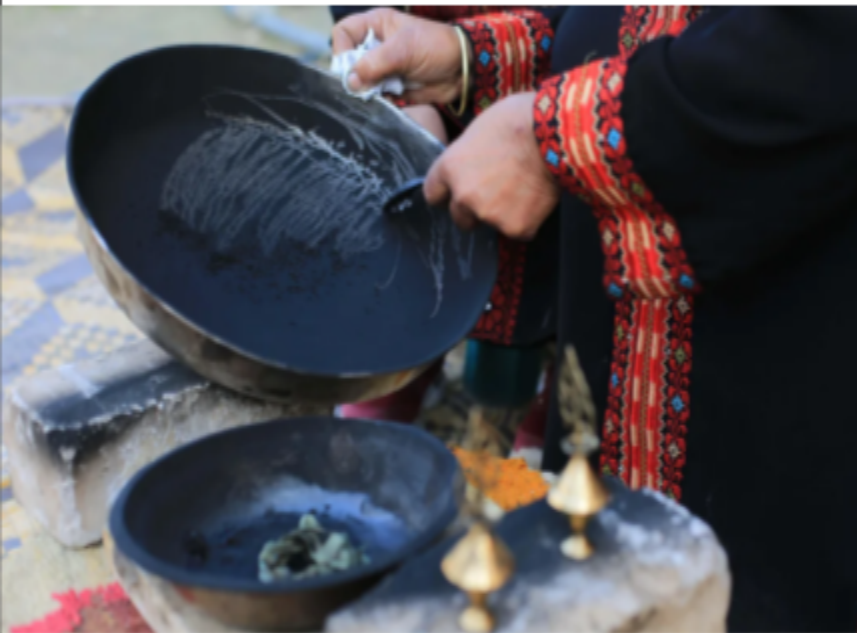
Figure 2 Traditional Kohl

Traditional Kohl eyeliner being made for cosmetic and medical purposes