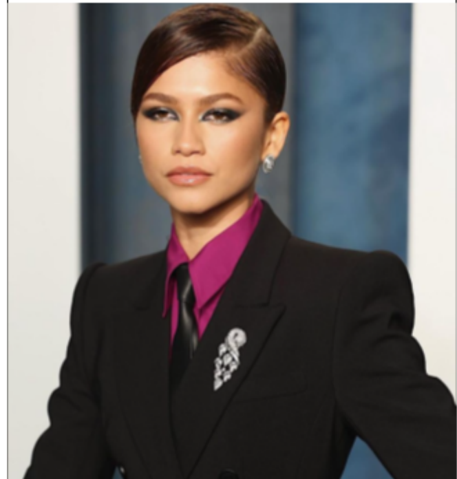
Vanity Fair 2022