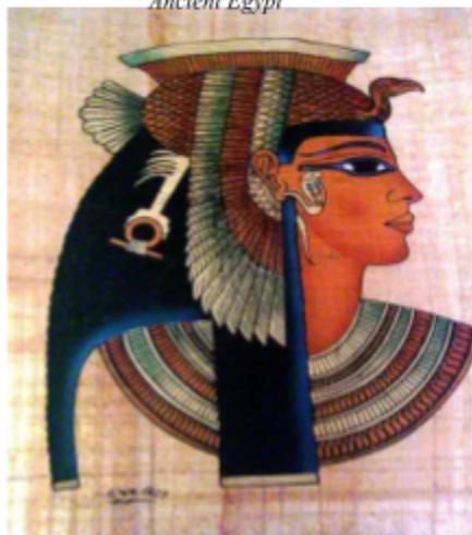
Figure 1 Ancient Egypt

Ancient Egyptian Wearing The Cat