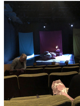
Stage of performance

Why did you choose these images? Do they summarize a feeling you have for the performance space? Do they focus on prominent objects or features? Explain.