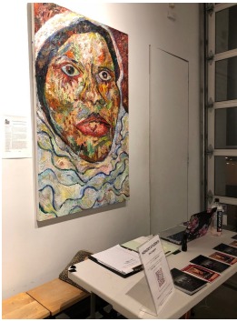
Checking in/box seat play

Insert 3 photographs and provide a title for each image. The title should be a word or short phrase that sums up the subject matter of the photo or a visual theme present in the photo.