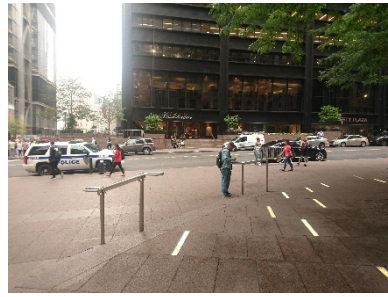
Law enforcement Presence