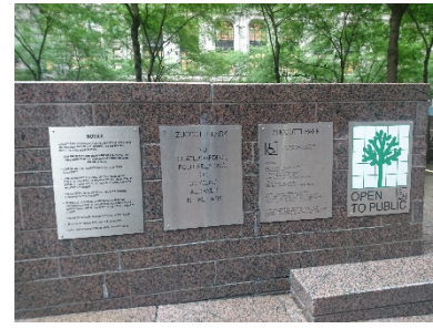
Park Signage & Notices

Why did you choose these images? Do they summarize a feeling you have for the place? Do they focus on prominent objects or features of the place? Explain.