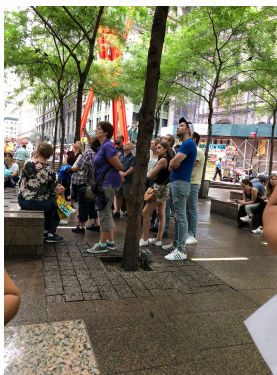
Tourist and Sculpture

Insert 3 photographs and provide a title for each image. The title should be a a word or short phrase that sums up the subject matter of the photo or a visual theme present in the photo.