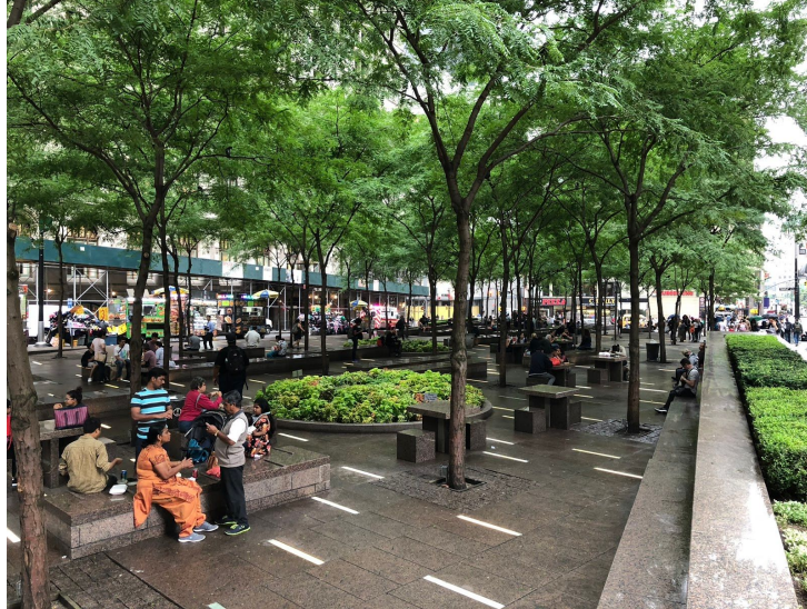
East side of Zuccotti Park on a cloudy afternoon