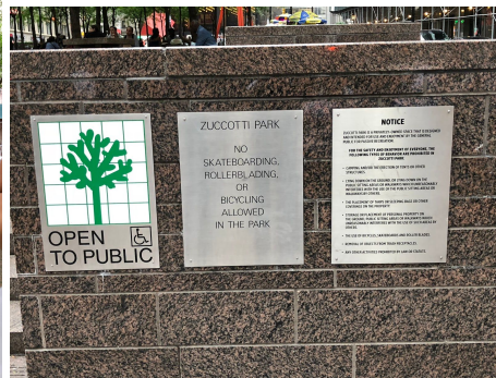
Laws or rules