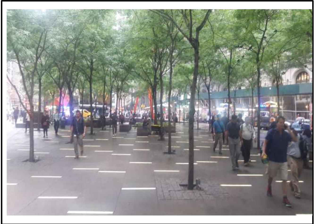
Zuccotti Park pathway

Insert 3 photographs and provide a title for each image. The title should be a word or short phrase that sums up the subject matter of the photo or a visual theme present in the photo.