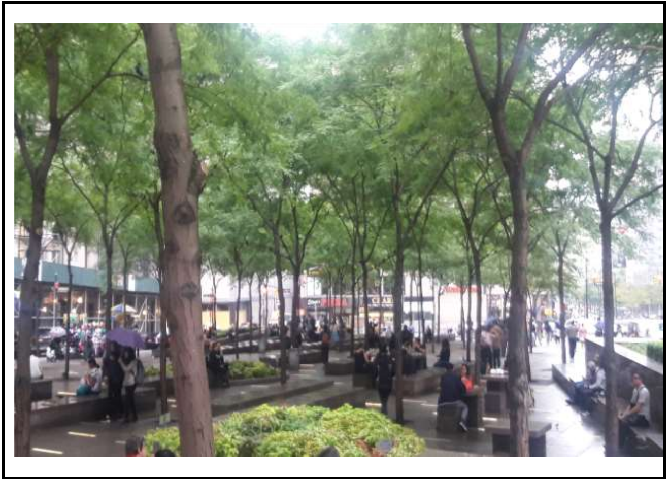
Pedestrians eating and resting in Zuccotti Park