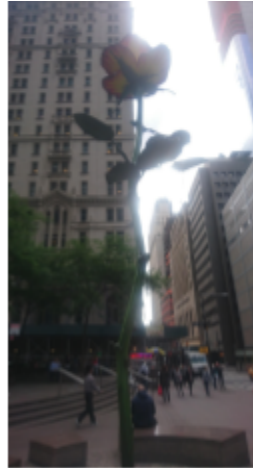
The metal rose in the concrete jungle