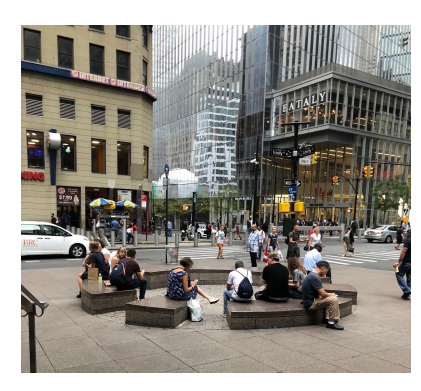
People having conversation or just sitting down material

Insert 3 photographs and provide a title for each image. The title should be a a word or short phrase that sums up the subject matter of the photo or a visual theme present in the photo.