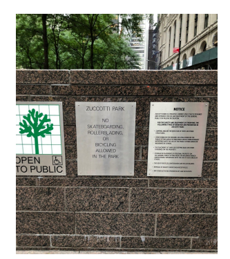
The signage located at the entrance of the park