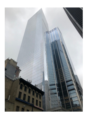
The change of scale and

Why did you choose these images? Do they summarize a feeling you have for the place? Do they focus on prominent objects or features of the place? Explain.