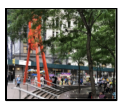
Bold Art Piece