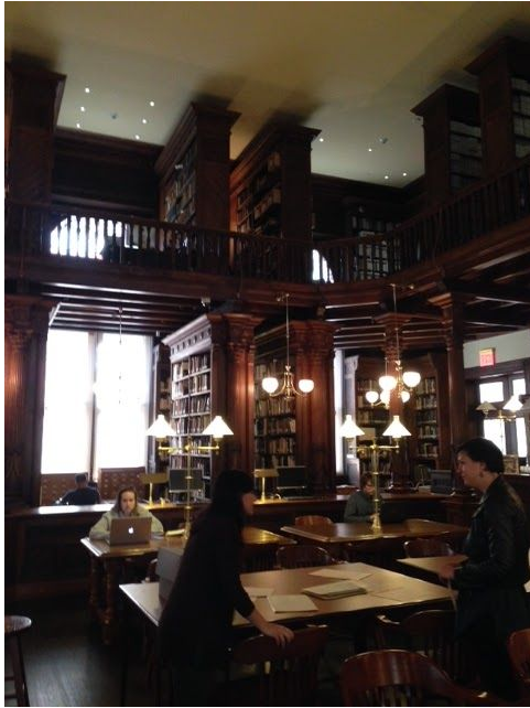
(left) Another shot of the inside of the Othmer Library.

(below photos) I came across a map in another room as we were leaving, of Brooklyn during 1766. The map includes Brooklyn Heights, DUMBO, Vinegar Hill, the Brooklyn Navy Yard and other neighborhoods. It is hard to see the numbers on the map, but the numbers represent difference buildings like churches, parks, etc. Those places are referenced in the picture on the right.