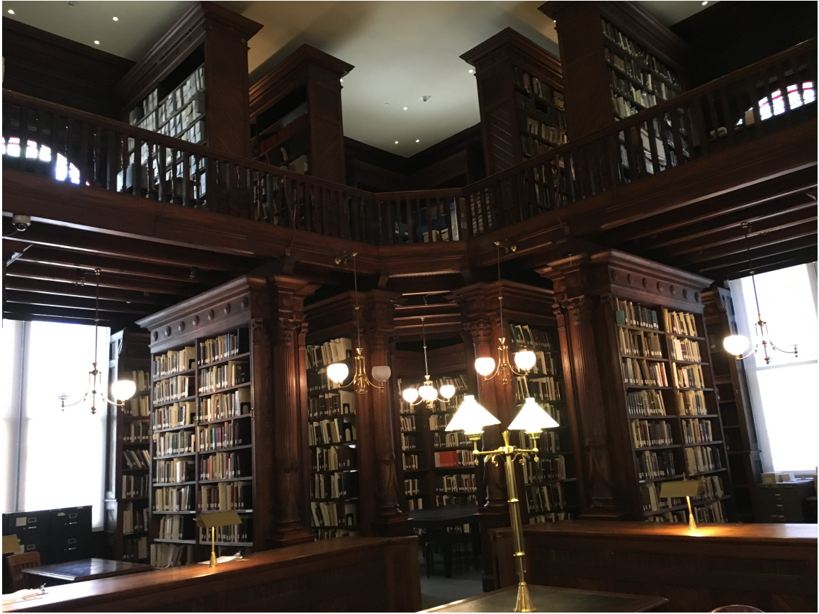
This is a picture of the BHS library where the class did research for our final project. This library is very vast, and is said to be have filmed in many movies.