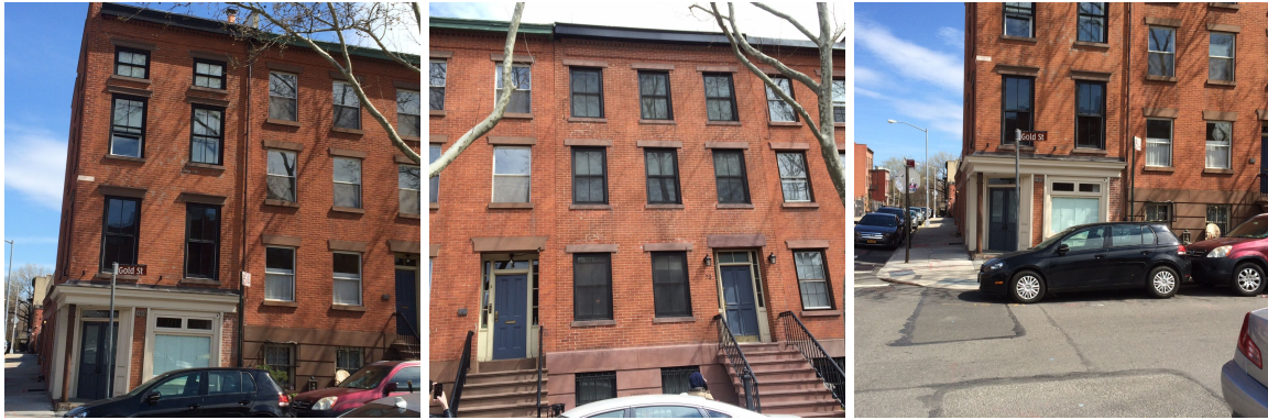
These are buildings located where the class did their second sketches, they are all connected.