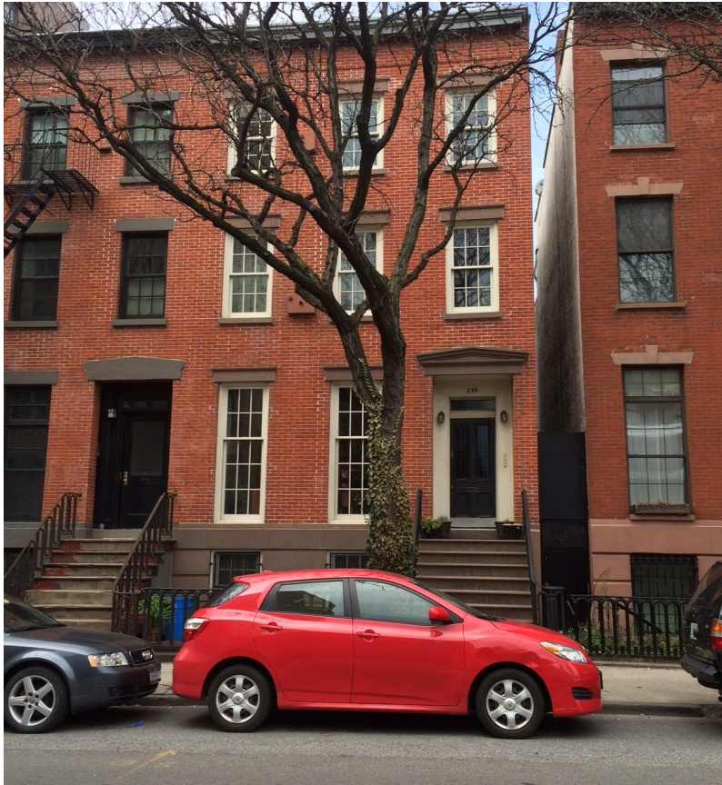
This is a photo of the building I based my sketch off of. It was the third and final building the class had to draw as a whole. This building is located on Front Street and Gold Street.