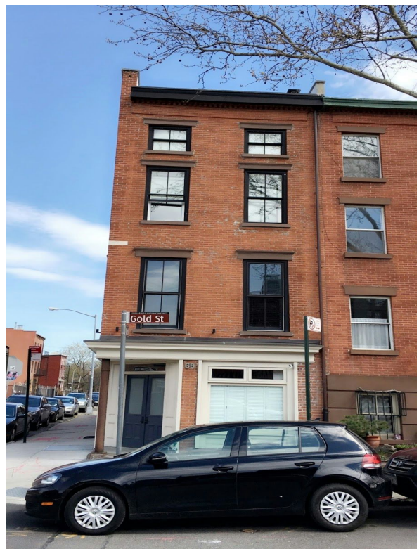
Photo on the left is sketch of the second building which was on the corner of water street and Gold street. As you can see this building is combination of both residential and commercial. This building was also built in 19th century but by looking at this building today i could tell i had some modern touches on it, for example windows, glass and security cameras. One thing you can notice in this building very clearly is the different size of all floor windows, looks like first 3rd floor is not an actual residential floor it looks more like storage room because windows are really