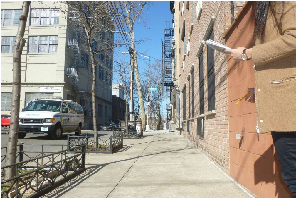
Hudson Ave/Front Street, zone 7 of our maps