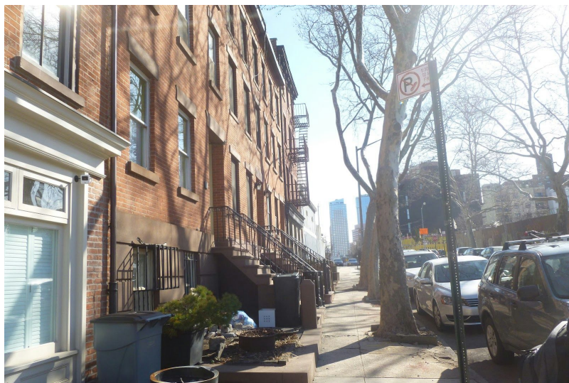
Gold Street. These buildings are more contemporary than the ones on Hudson Ave.