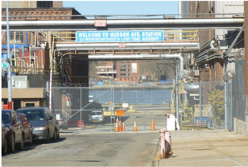
East River waterfront