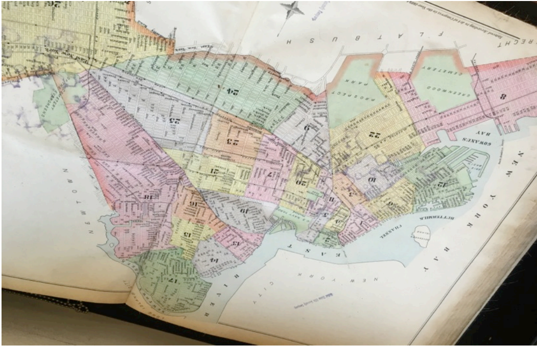
Picture of Brooklyn with its special districts noted into numerical order. 1877