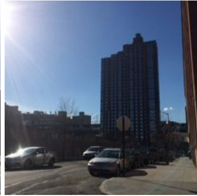
These are some pictures of neighboring structures of the site my partner and I focused on.