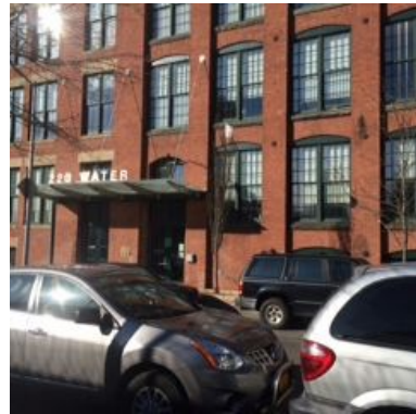
These are buildings that are not too far from the buildings I took an interest in.