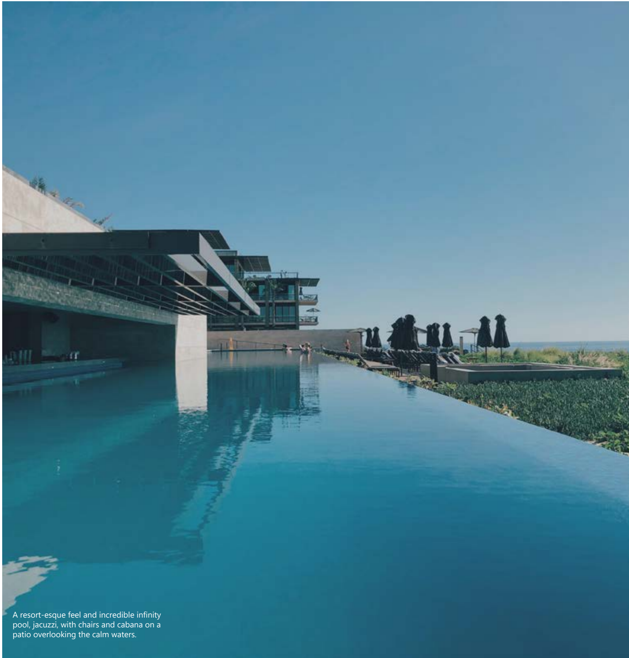
A resort-esque feel and incredible infinity pool, jacuzzi, with chairs and cabana on a patio overlooking the calm waters.

One morning, when Gregor Samsa woke from troubled dreams, he found himself transformed in his bed into a horrible vermin. He lay on his armour-like back, and if he lifted his head a little he could see his brown belly, slightly domed and divided by arches into stiff sections. The bedding was hardly able to cover it and seemed ready to slide off any moment. His many legs, pitifully thin compared with the size of the rest of him, waved about helplessly as he looked. "What's happened to me?" he thought. It wasn't a dream. His room, a proper human room although a little too small, lay peacefully between its four familiar walls.