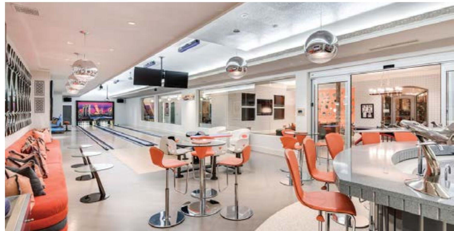
▶ Bowling alley beautifully placed in front of bar

Far far away, behind the word mountains, far from the countries Vokalia and Consonantia, there live the blind texts. Separated they live in Bookmarksgrove right at the coast of the Semantics, a large language ocean. A small river named Duden flows by their place and supplies it with the necessary regelialia. It is a paradisematic country, in which roasted parts of sentences fly into your mouth.