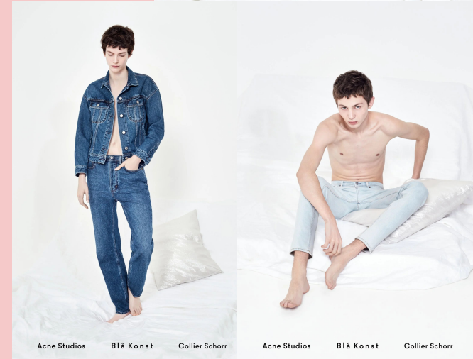
Figure 7. Blå Konst.