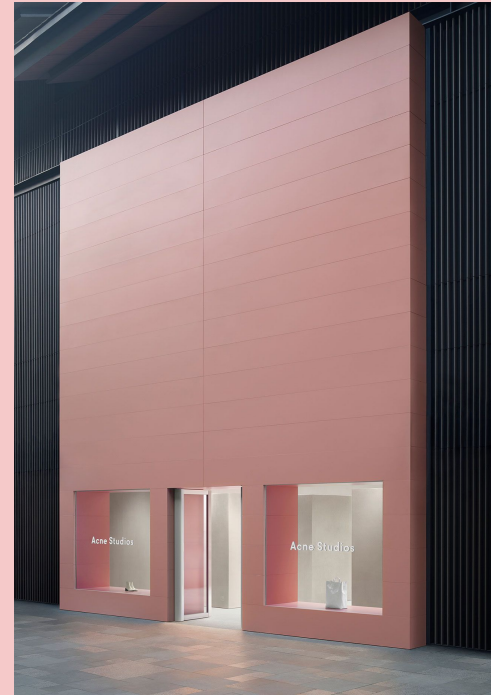
Figure 5. Acne Studios Taikoo Li Chengdu.

Acne Studios' aims to provide quality clothing, that are timeless focusing on environmental strategy