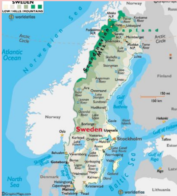
Figure 1. World Atlas. Sweden's Geographical Features. Retrieved from https://www.worldatlas.com/webimage/country/europe/sweden/seland.htm