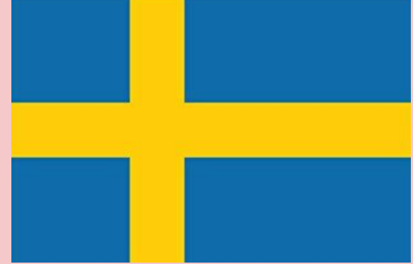
Figure 2. World Atlas. Sweden's Geographical Features. Retrieved from https://www.worldatlas.com/webimage/country/europe/sweden/seland.htm

Neighbor to Norway and Finland, both share the same border.