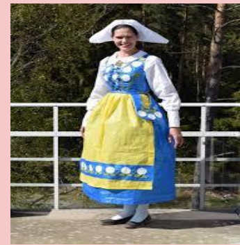
Figure 3. Swedish Traditional Dress. Sweden woman in Folk Dress.