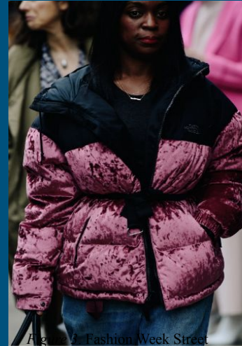
Figure 3. Fashion Week Street Style Stars Beat the Cold With Bright Colors and Great Coats, by Adam Katz(2019)