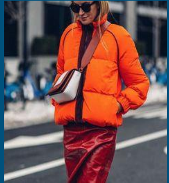
Figure 2. A woman In a Orange coat, from Colorful Winter Coats at NYFW, by Andrew Morales (2019)