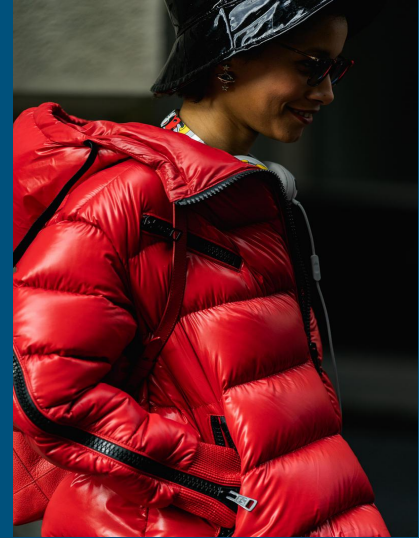
Figure 1. Woman in red puffer coat. The best street style moments from NYFW, by Eddie Lee (2019)