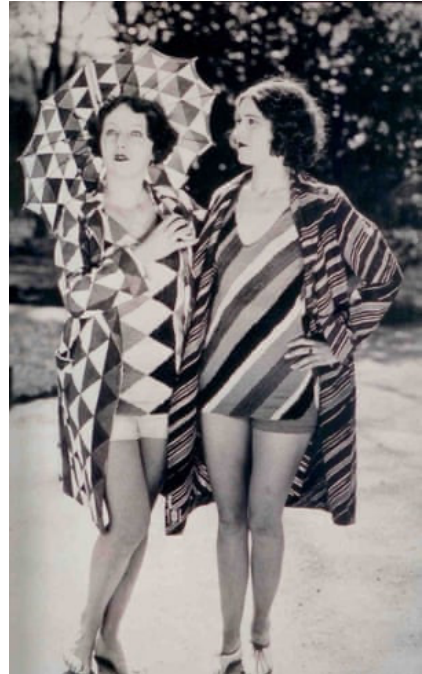
LEFT: Moschino Shirt 1988 (Figure 1) RIGHT: Delaunay Bathing Suits 1920s (Figure 2)