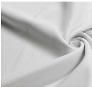
Scuba Knit. 100% Polyester