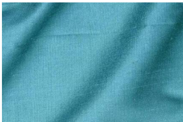
100% Silk Shantung