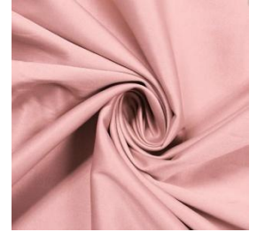
Shakira satin . 55% poly, 42% cotton, 8% spandex