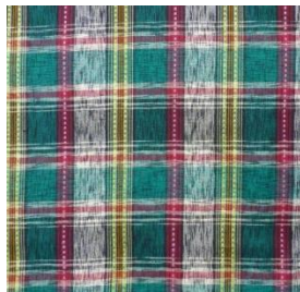
Plaid Ikat. 100% Cotton