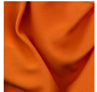
Poplin fabric. 100% polyester