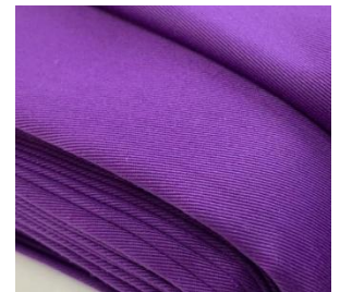
80% cotton, 20% polyester