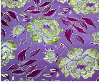
Tapestry brocade. 100% polyester