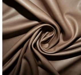
Stretch pleather , Faux leather. 92%polyester, 8% Spandex.