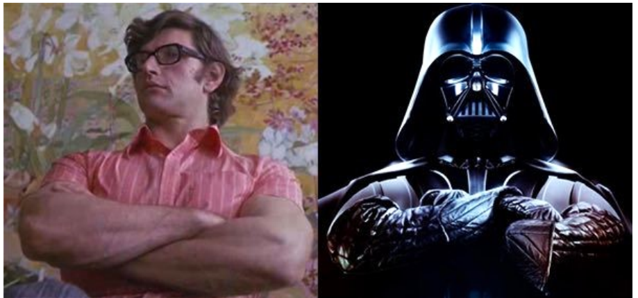
David Prowse, who plays Julian, the home healthcare assistant was later cast as Darth Vader (always in costume) in the first three Star Wars films.