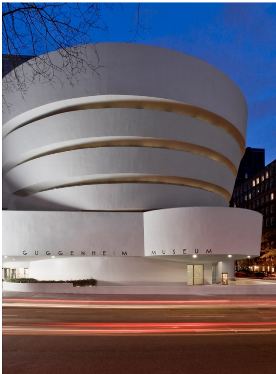
Frank Lloyd Wright