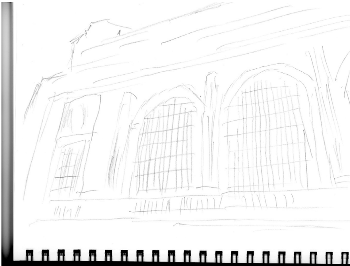
This is a sketch from where we were waiting outside the Grand Central Terminal